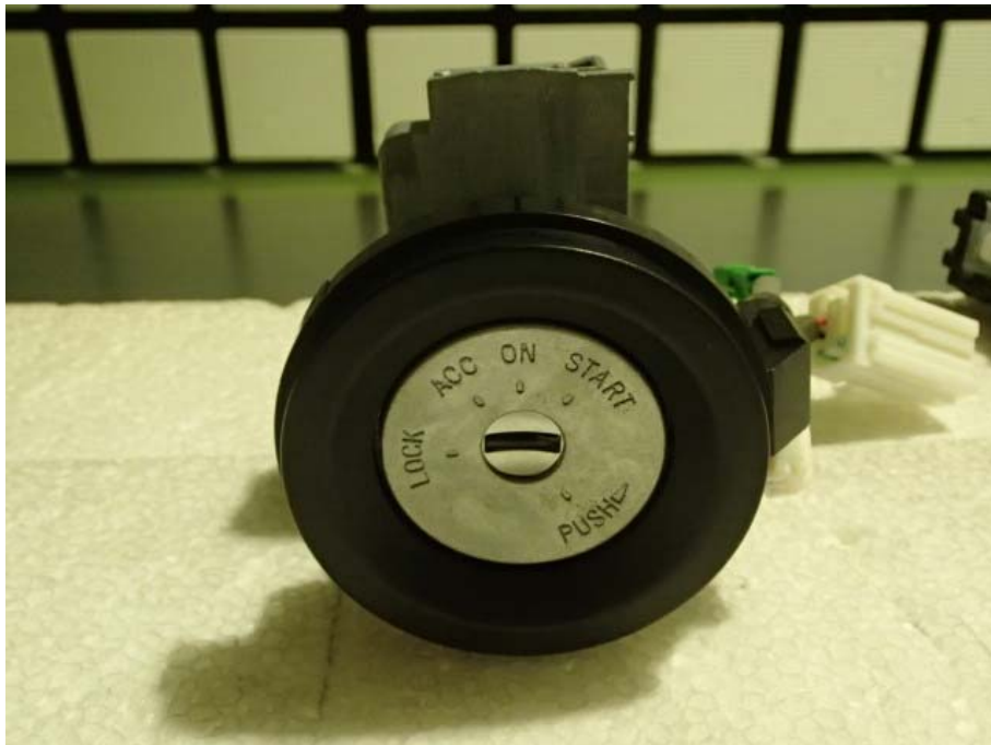
Without key (Worst)