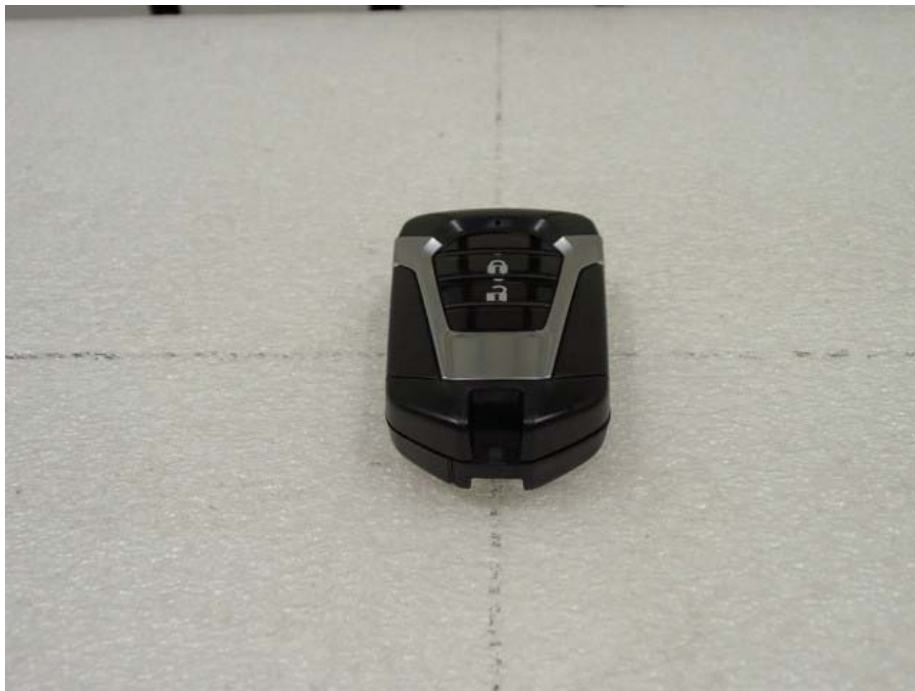
Mechanical Key (Inserted) Worst