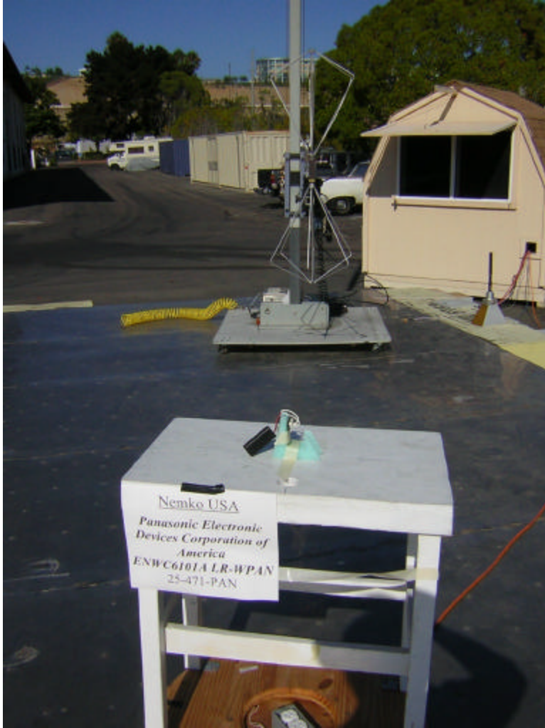
RF Radiated 15C measurements.