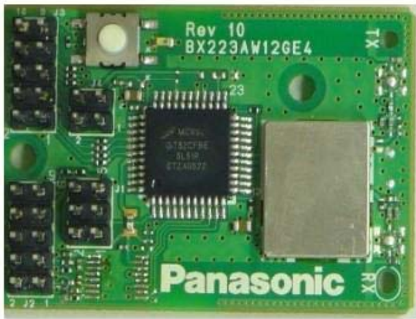
PAN802154 MODULE TOP VIEW TOP VIEW WITHOUT RS232