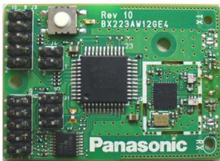
PAN802154 WITHOUT COVER