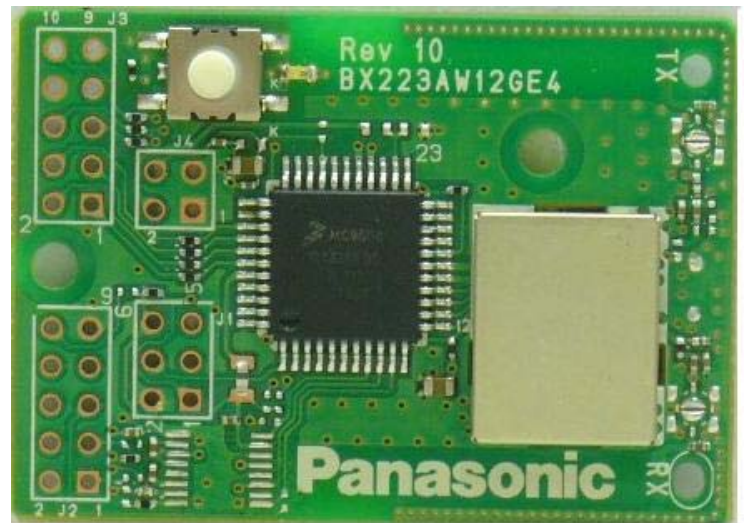
PAN802154 MODULE TOP VIEW WITHOUT HEADERS AND WITHOUT RS232 IC