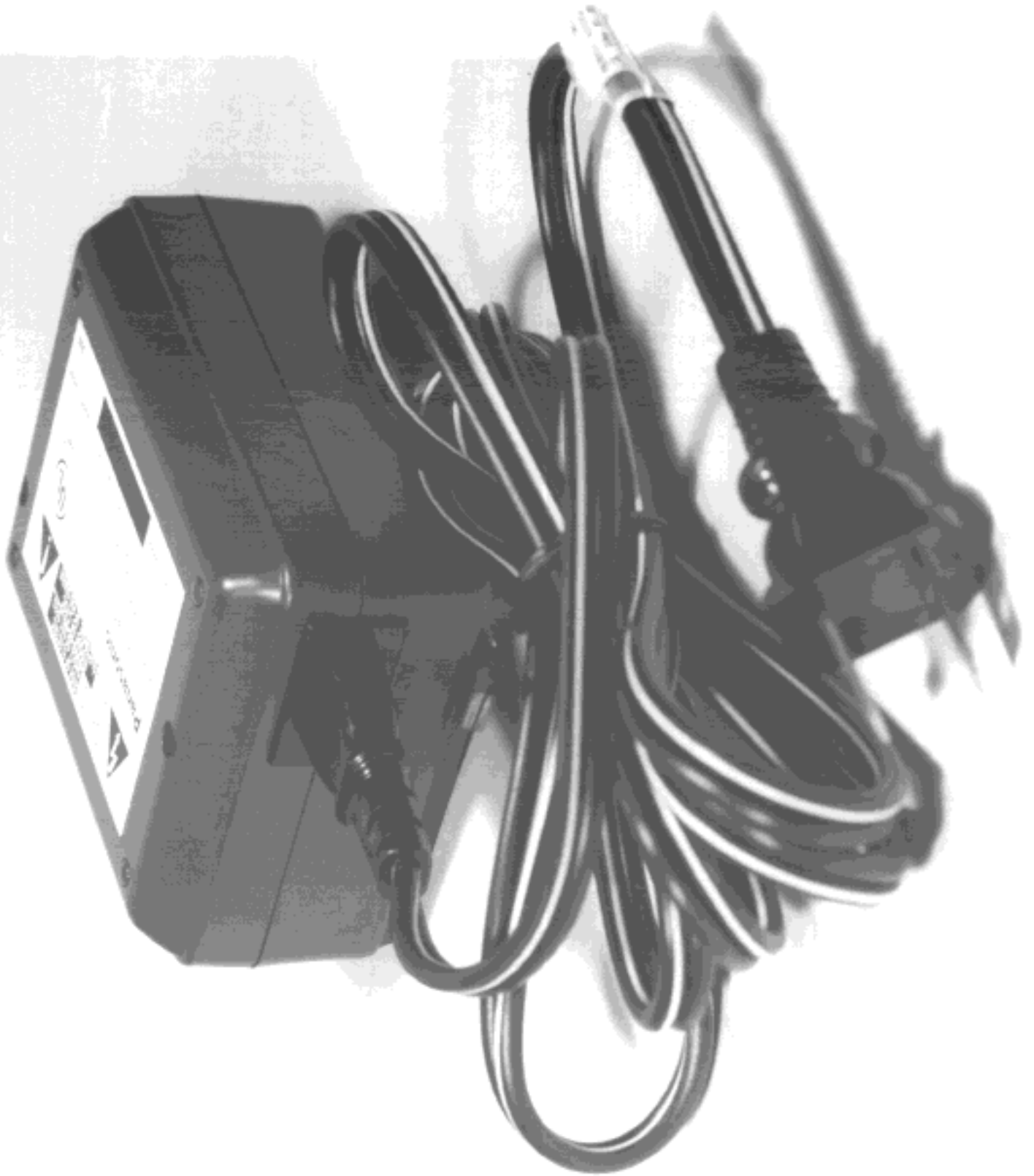
EXHIBIT # _____ FIG NO. _____ FCC ID: ACJ5LU0033 MODEL NO: PV-DV910B OUR REF: MKS98-File