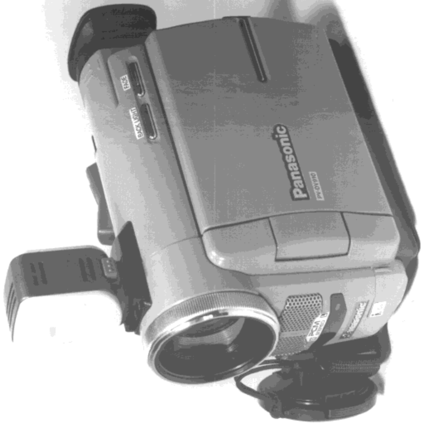
EXHIBIT # _____ FIG NO. _____ FCC ID: AGT5L40033 MODEL NO. PV-DV9100 OUR REF: MKS98-F010