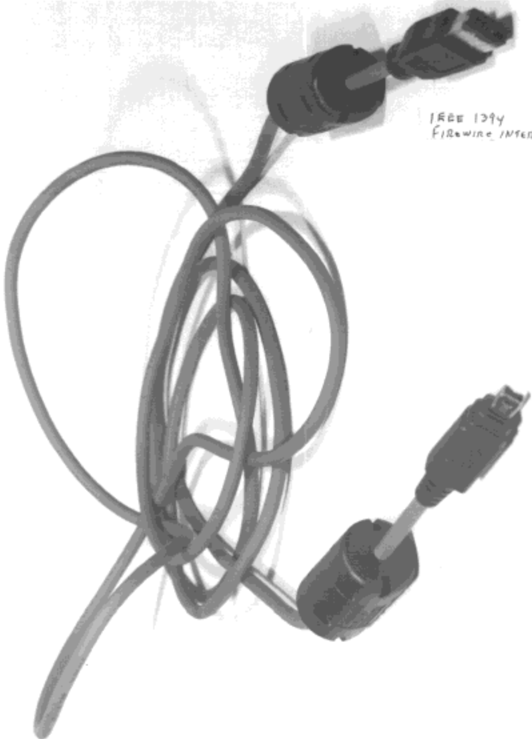
DV Interface Cable

EXHIBIT # _____ FIG NO. _____ FCC ID: AGT5240033 MODEL NO. PV-DV910D OUR REF: MKS98-7010