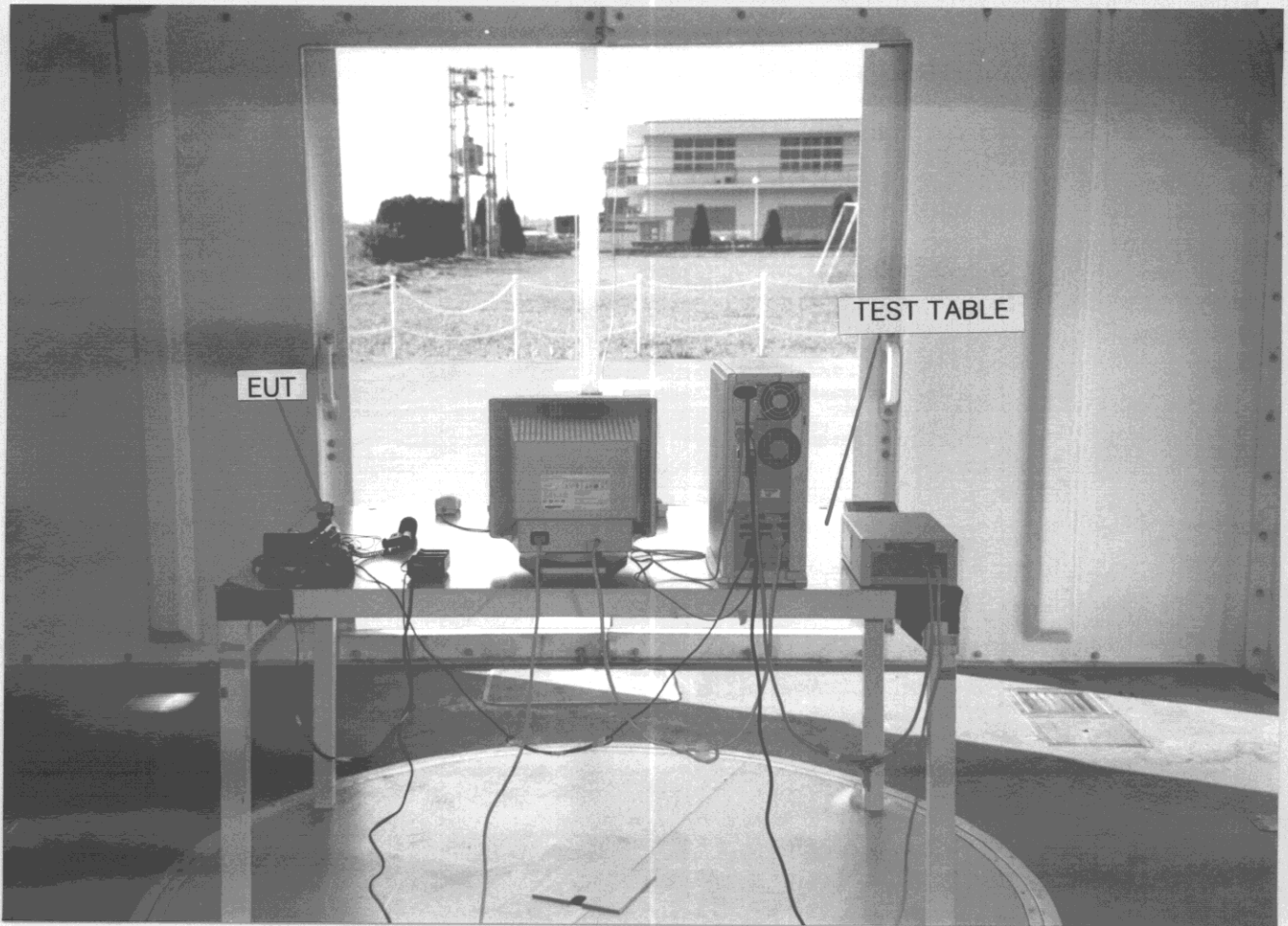
EXHIBIT # : 3-1 FCC ID : ACJ5LU0033 OUR REF. : MKS98-F010 MODEL NO. : PV-DV910D Sheet 6 of 9 Sheets Page 2/2

( Arrangement of interface cable on the test table )