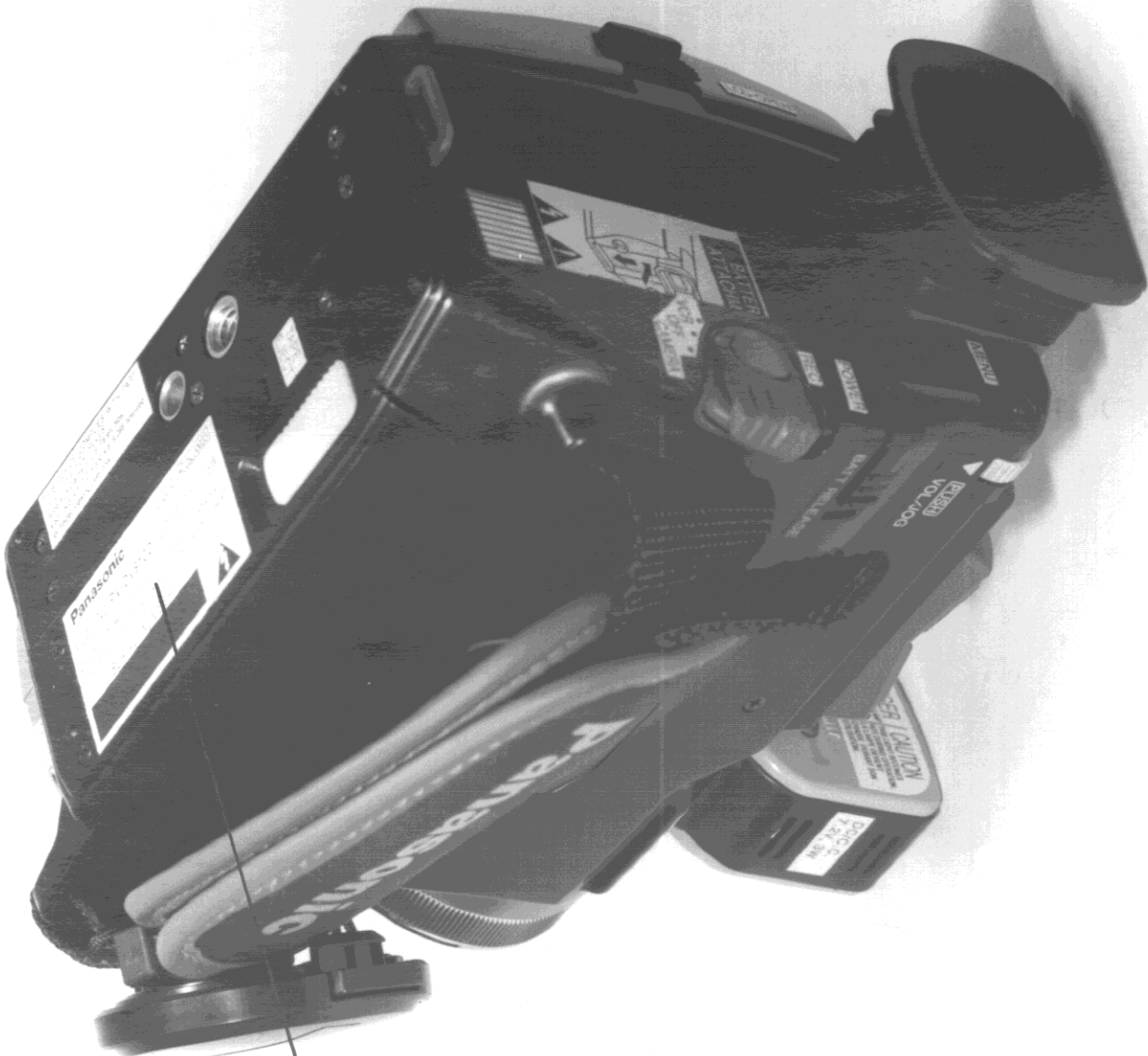
EXHIBIT # 2 FIG NO. _____ FCC ID: ACJ5LU0033 MODEL NO. PV-DV910D OUR REF.: MKS98-Foro