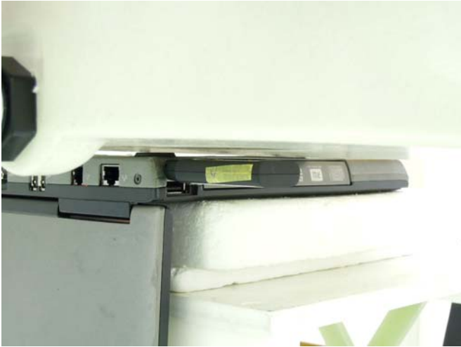
Horizontal Up with 0.5 cm Gap