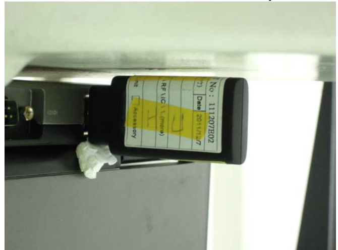
Vertical Back with 0.5 cm Gap