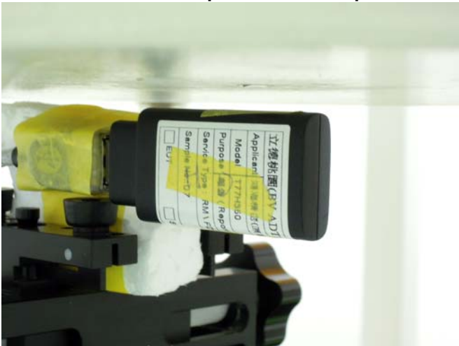
Vertical Front with 0.5 cm Gap