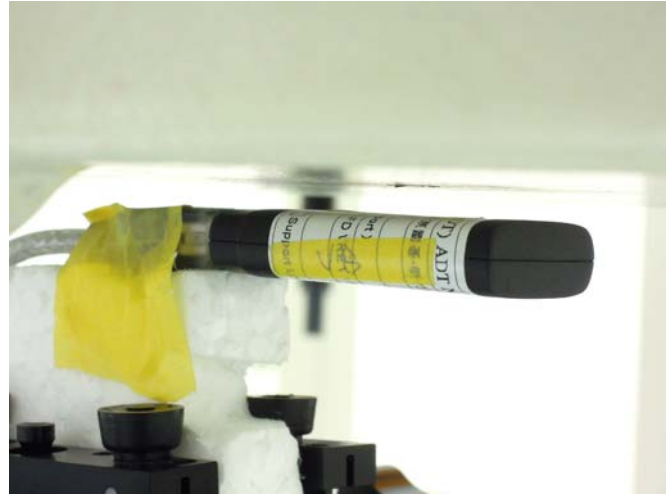
Horizontal Down with 0.5 cm Gap