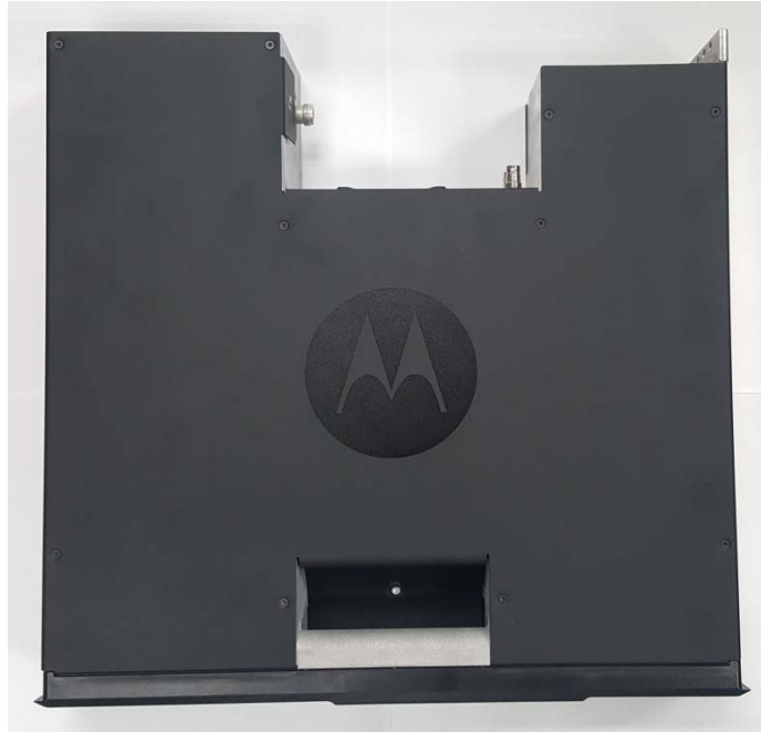
Exhibit 3G –Top View of Base Radio, Top Panel Removed