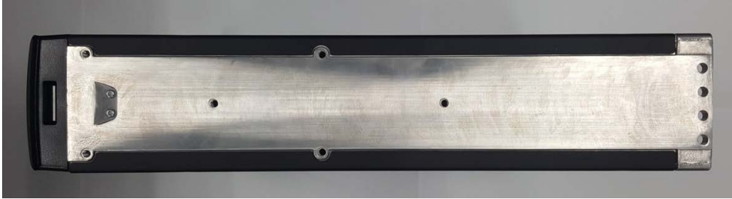
Exhibit 3E – Side View of Base Radio (Left)