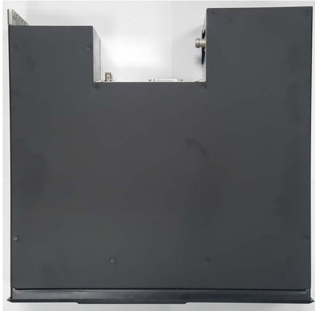
Exhibit 3I – Bottom View of Base Radio, Bottom Panel Removed