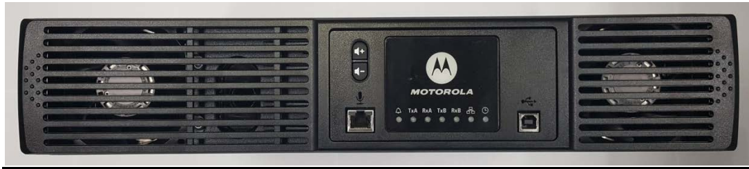
Exhibit 3B – Front View of Base Radio, Front Panel Removed