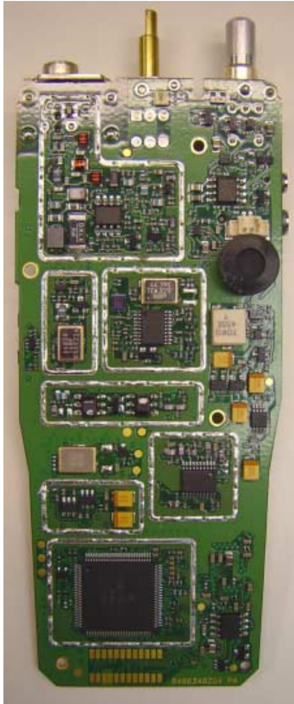
VIEW OF HOUSING-SIDE OF CIRCUIT BOARD WITH ALL SHIELDS REMOVED