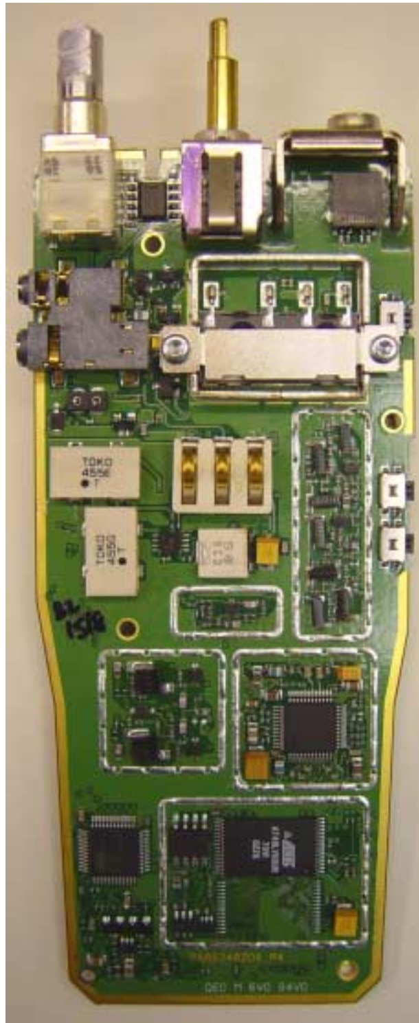
VIEW OF CHASSIS-SIDE OF CIRCUIT BOARD WITH ALL SHIELDS REMOVED