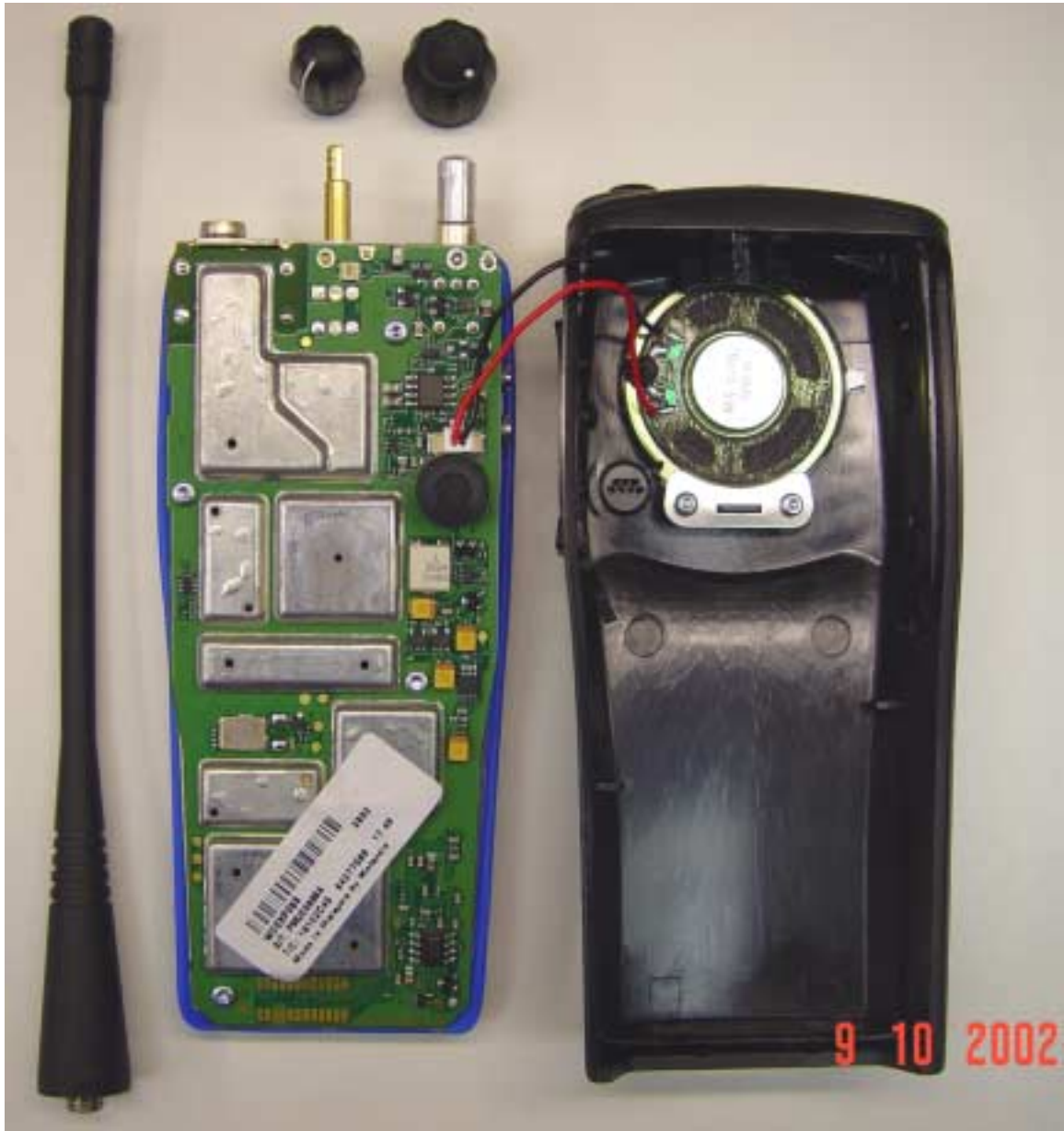
REAR VIEW WITH CIRCUIT BOARD REMOVED FROM HOUSING (MATING SURFACES OF BOARD AND HOUSING ARE SHOWN)