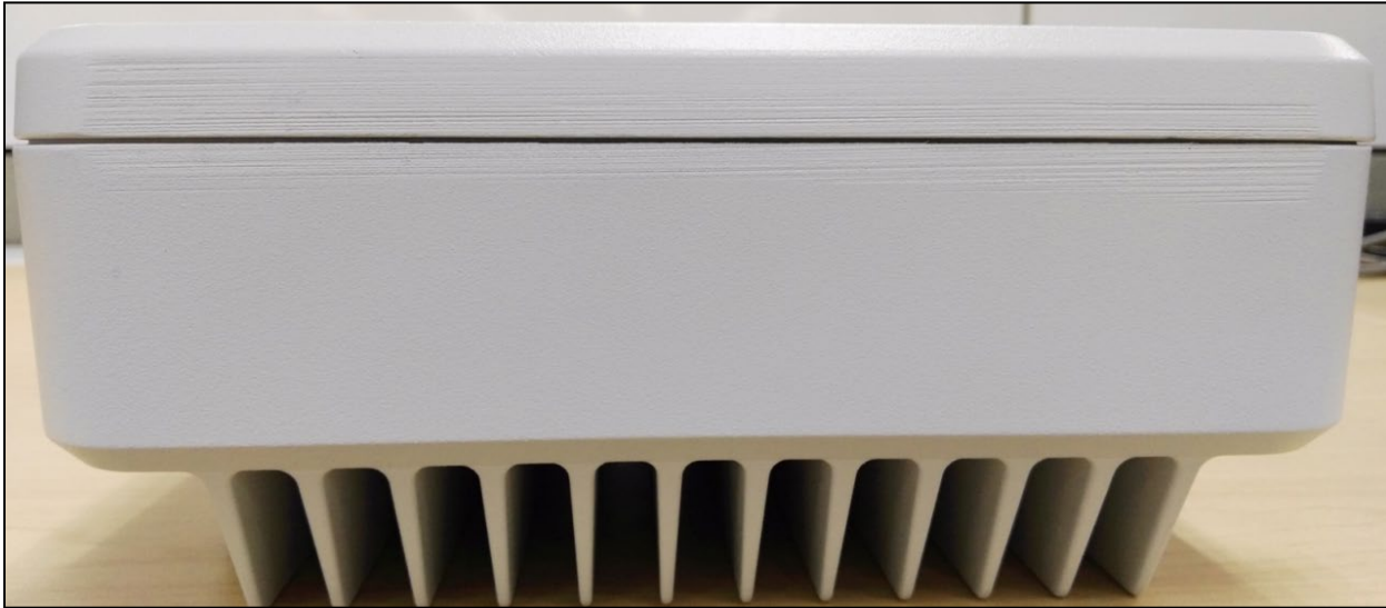
Exhibit 3G – Bottom View of Base Radio