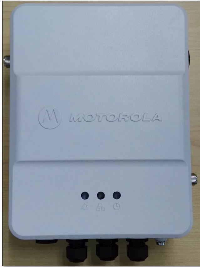
Exhibit 3A – Front View of Base Radio