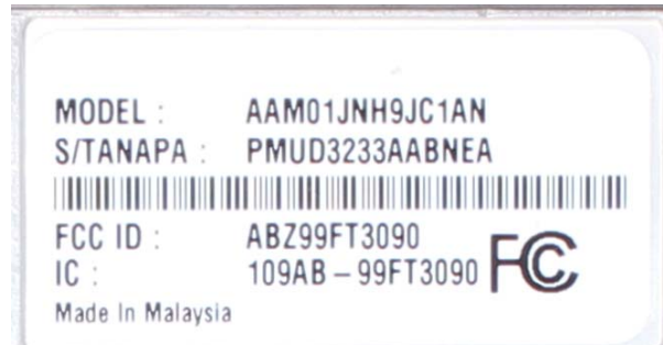
99 CHANNEL MODEL