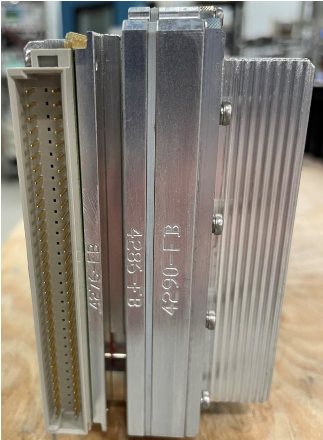
D3-1 Internal Back View – Transceiver Module