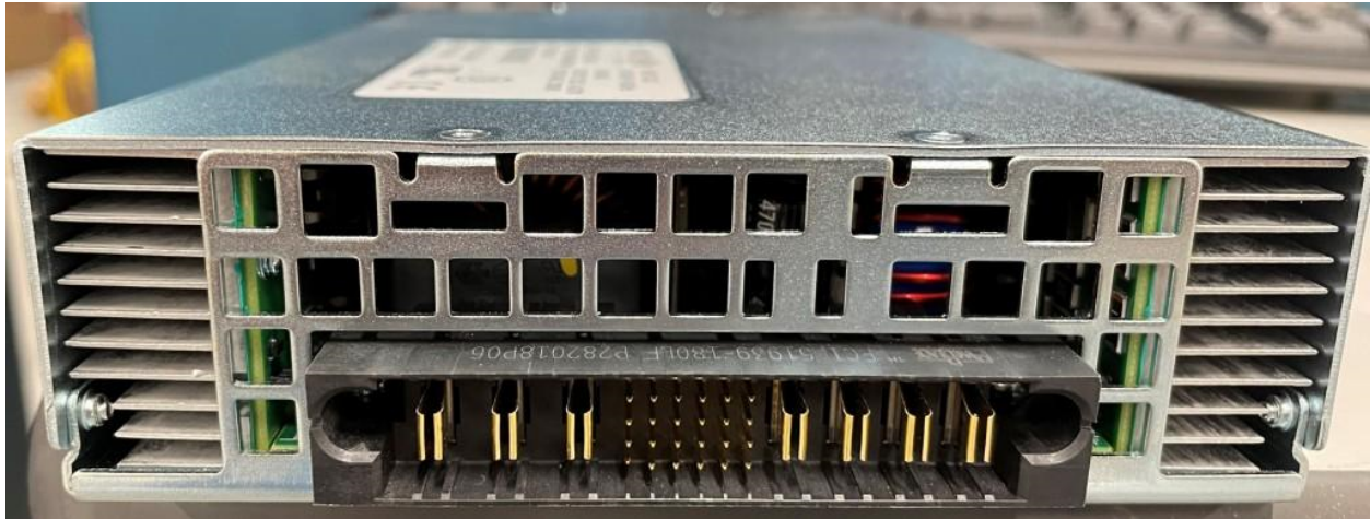
D3-4 Internal Back View – Power Amplifier Power Supply Module