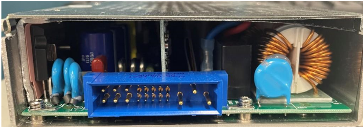
D3-3 Internal Back View – Transceiver Power Supply Module