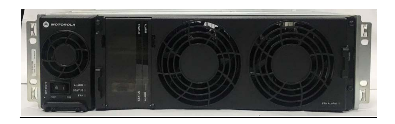
Exhibit 3B – External Front View of Base Radio, Front Panel Removed