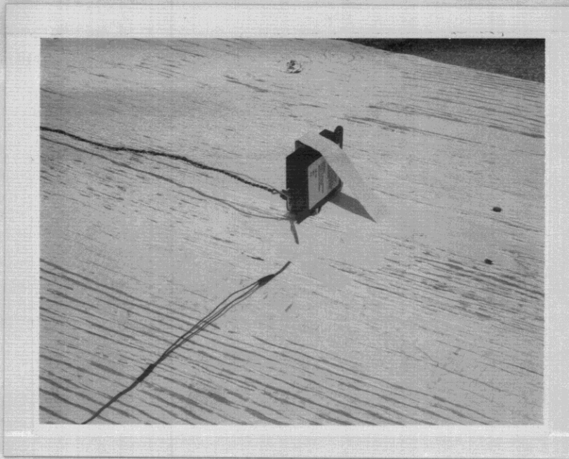
Figure 5.3. Close-up of the DUT on the open-site test table for worst case emissions at "fundamental".