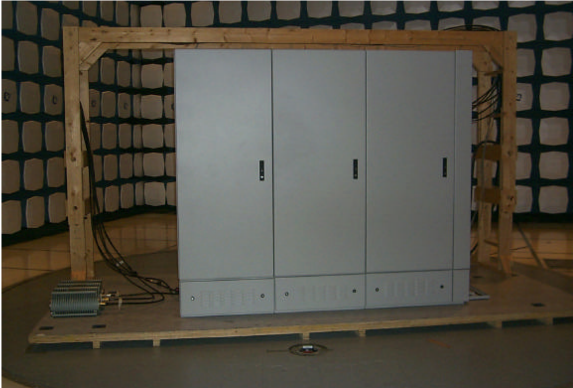
Figure 1: Front View of TDMA 800MHz Enclosure System