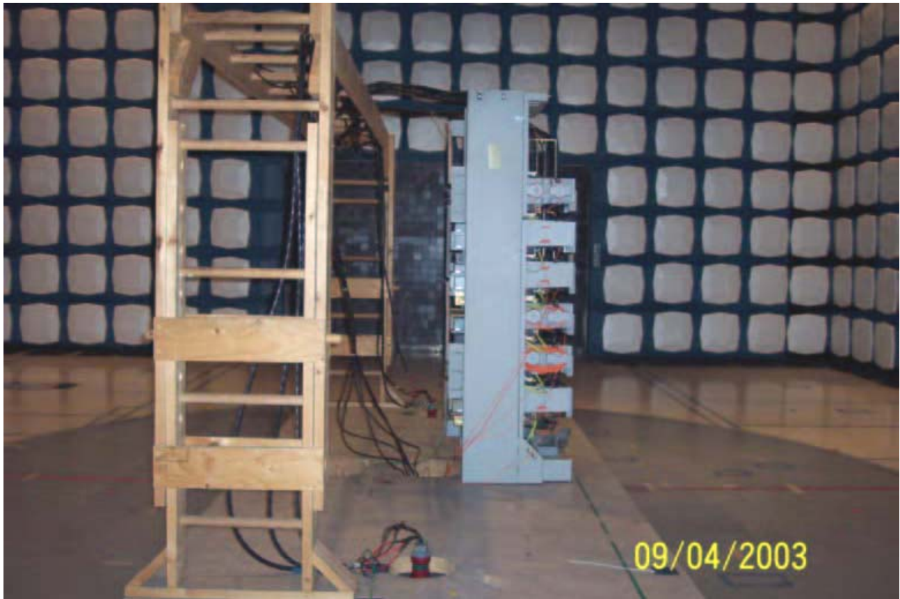
Test setup for the Radiated Emission Left