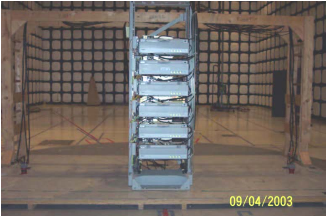
Test setup for the Radiated Emission Front