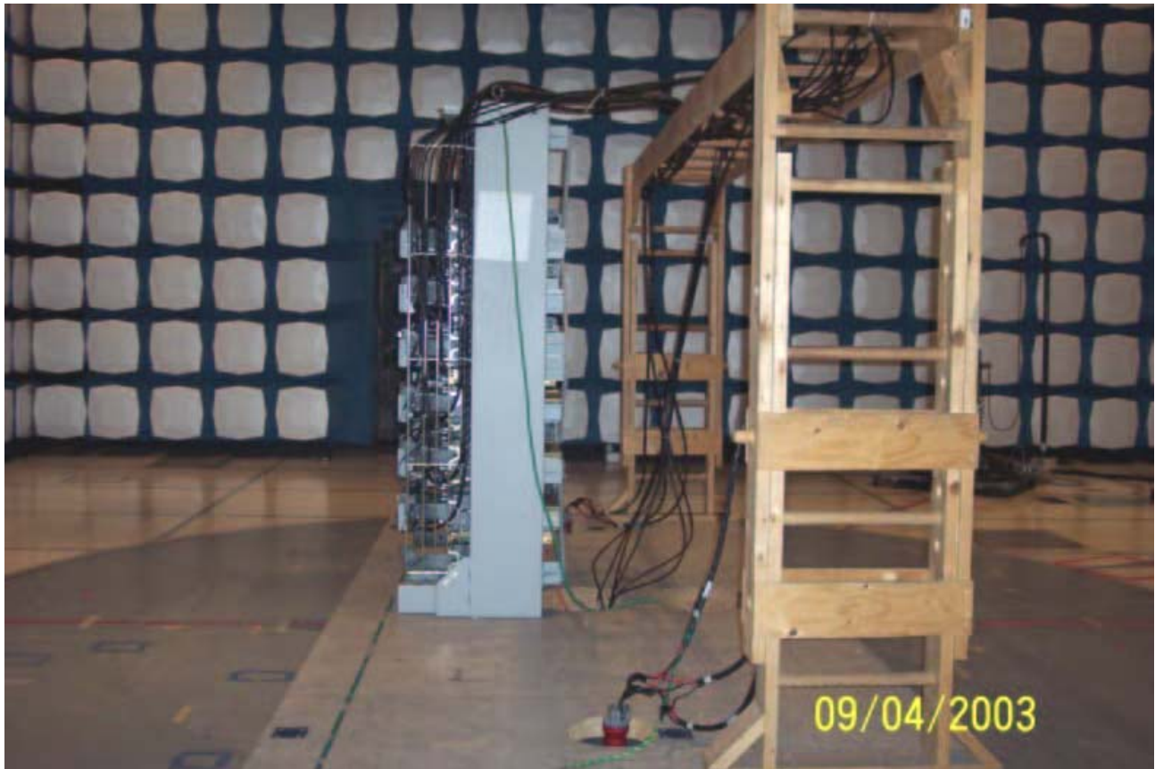
Test setup for the Radiated Emission Right