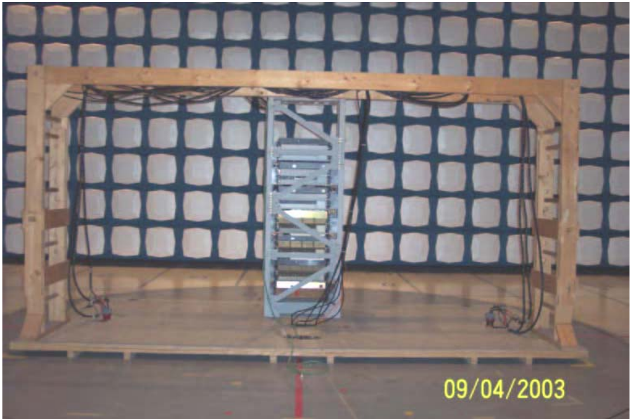
Test setup for the Radiated Emission Back