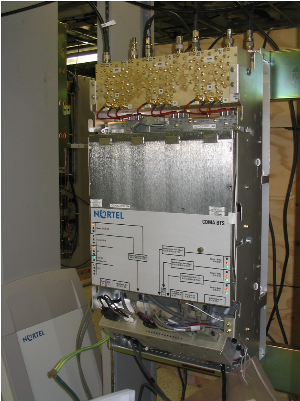
Nortel Networks vBTS 3030 Right Front Side View With Cover OFF

This document contains Proprietary information of Nortel Networks. This information is considered to be confidential and should be treated appropriately.