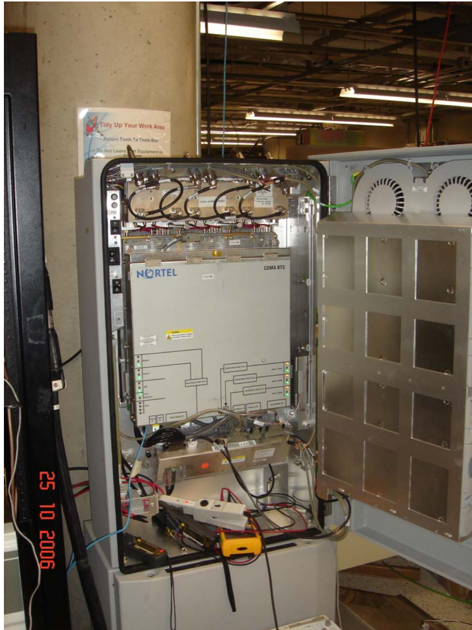
Nortel Networks vBTS 3031 Front View With Door Open

This document contains Proprietary information of Nortel Networks. This information is considered to be confidential and should be treated appropriately.