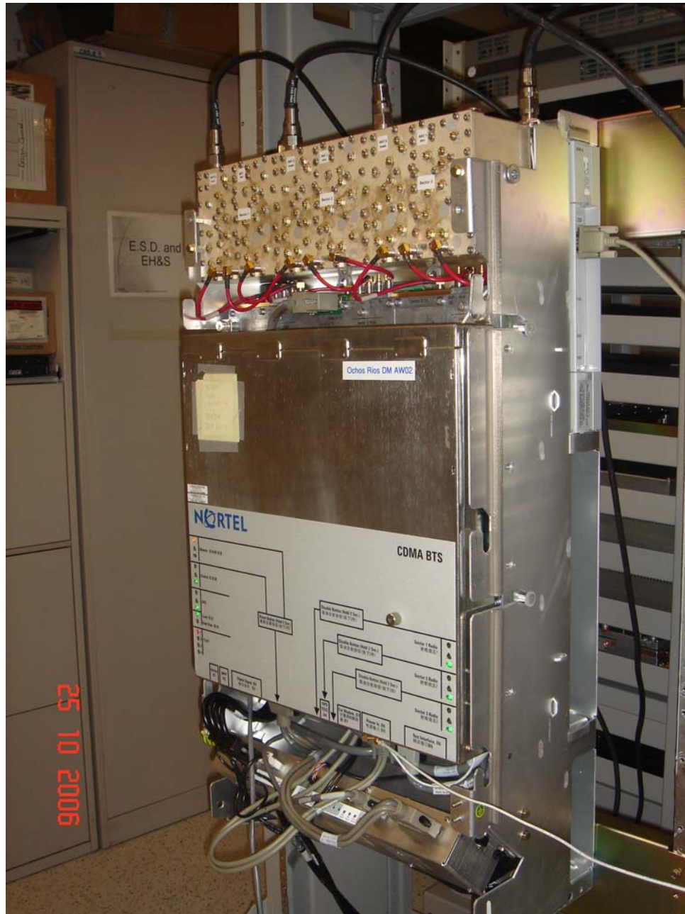
Nortel Networks vBTS 3030 Right Front Side View With Cover OFF

This document contains Proprietary information of Nortel Networks. This information is considered to be confidential and should be treated appropriately.