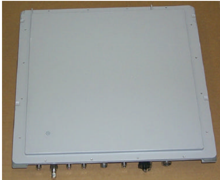
Figure 2: 1900 MHz TRM Bottom view

Test setup photographs for “Field Strength of Spurious Radiation” test: