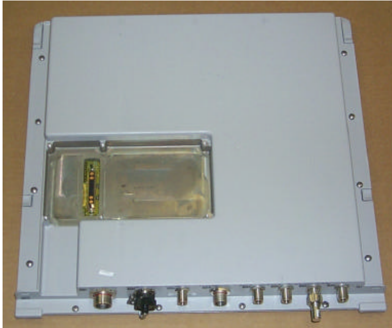
Figure 1: 1900 MHz TRM Top view

EUT (1900 MHz SFRM) external photographs: