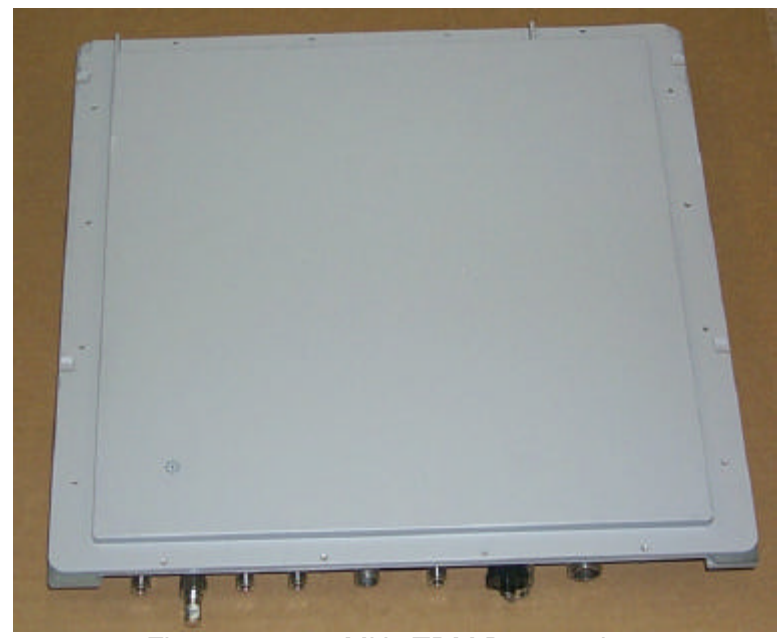
Figure 2: 1900 MHz TRM Bottom view

Test setup photographs for "Field Strength of Spurious Radiation" test: