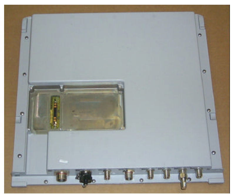
Figure 1: 1900 MHz TRM Top view