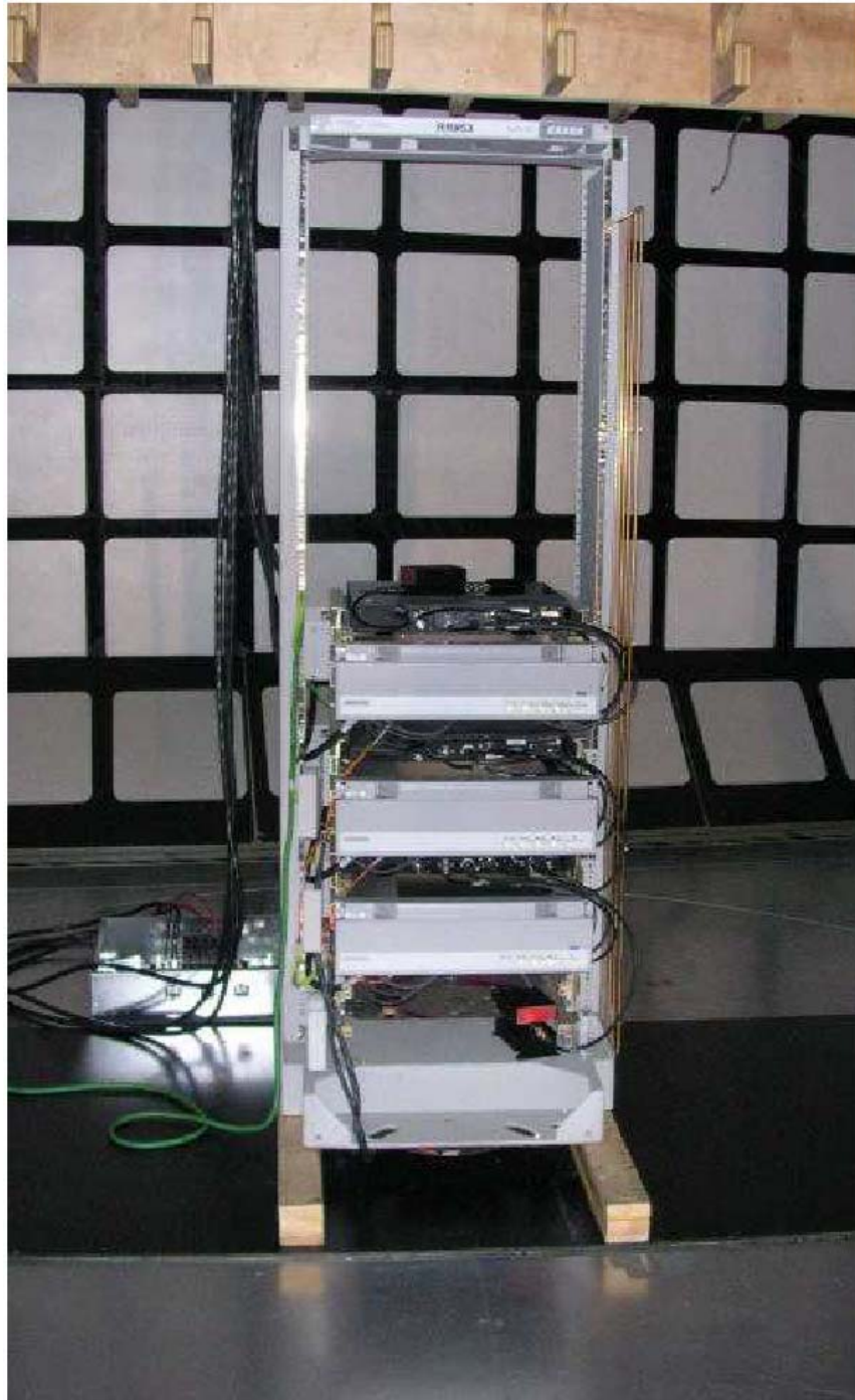
Test setup for the Radiated Emission

This document contains Proprietary information of Nortel Networks. This information is considered to be confidential and should be treated appropriately.