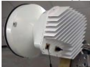
CTR 28-07M Transceiver

The CTR 28-07 MMIC (NTVG16CA) outdoor transceiver is a customer premise transceiver designed to operate in various Receiver (Rx) and Transmitter (Tx) frequency bands. It is a Nortel Networks Reunion product that operates in conjunction with base station products, as well as customer premise products. It is compatible with Reunion's Release 1.2 and 1.3 equipment.