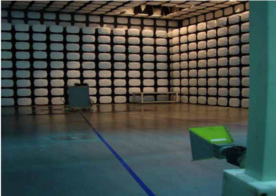
Radiated spurious Emission Test Set-Up 1G-6GHz