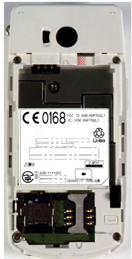
Figure A-2. FCC ID Label Location