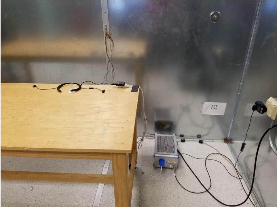
Setup – Front