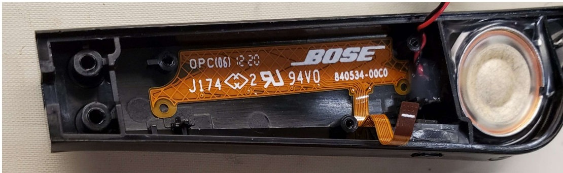
Capsense FPCs and transducer, Right temple