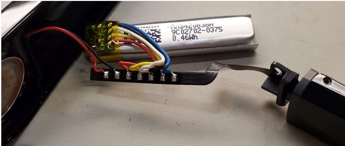
Left Temple Battery, transducer, and FPC solder connections