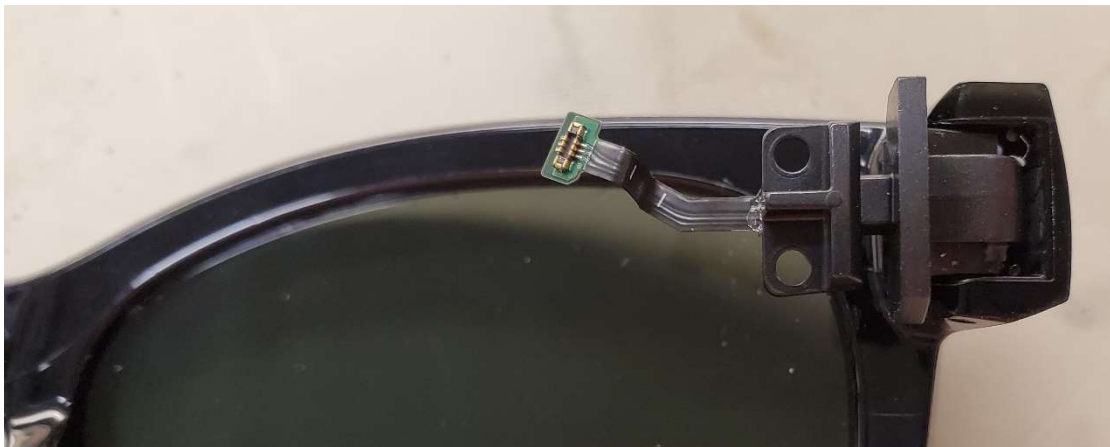
Right temple FPC connection (FPC is molded into the lens frame)