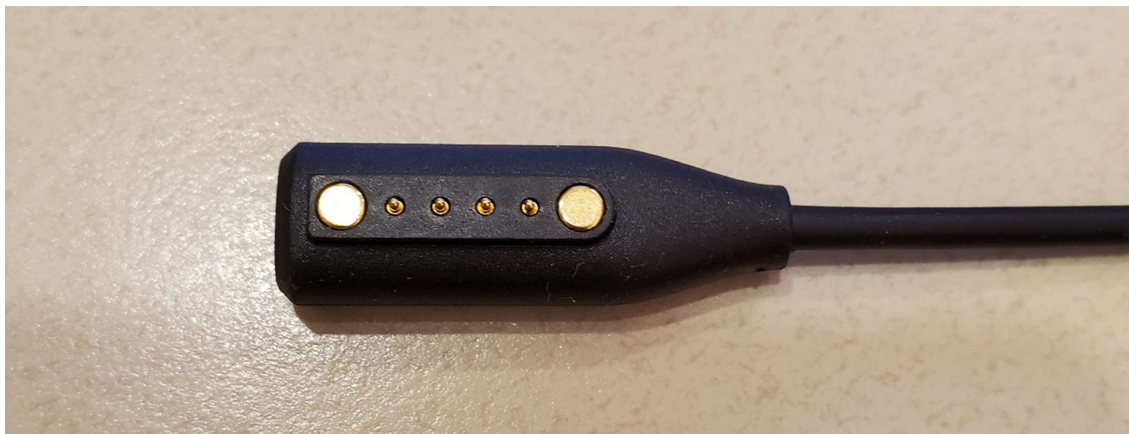
Charging cable connector