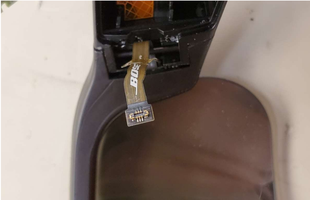
Right temple FPC connection (FPC is molded into the lens frame)