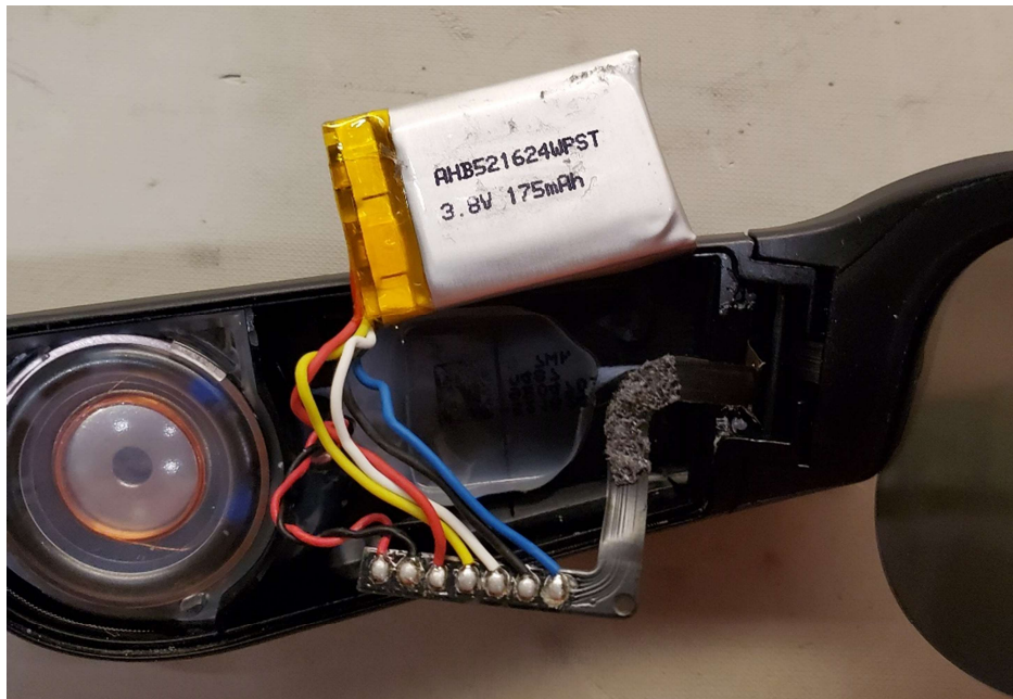
Left Temple Battery, transducer, and FPC solder connections (FPC is molded into the lens frame)