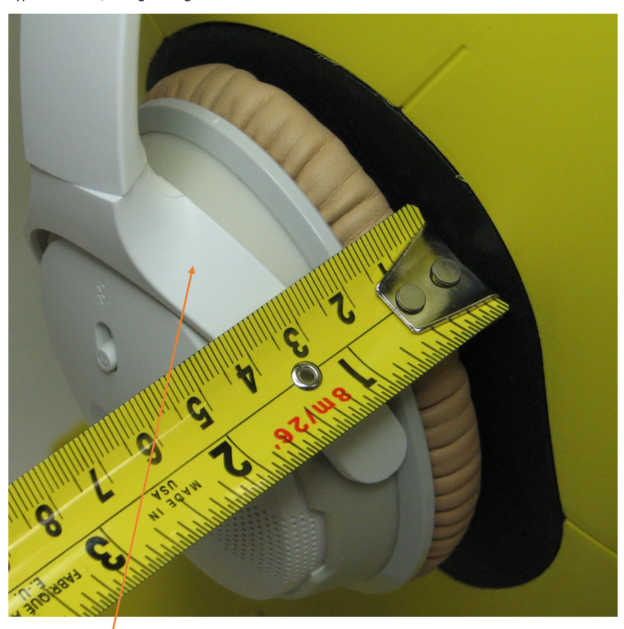
Typical use case, enlarged image