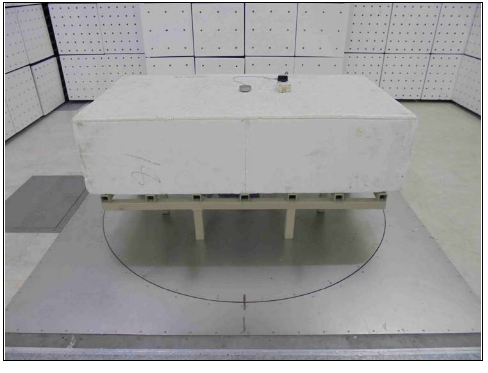
<Frequency Range below 1GHz>