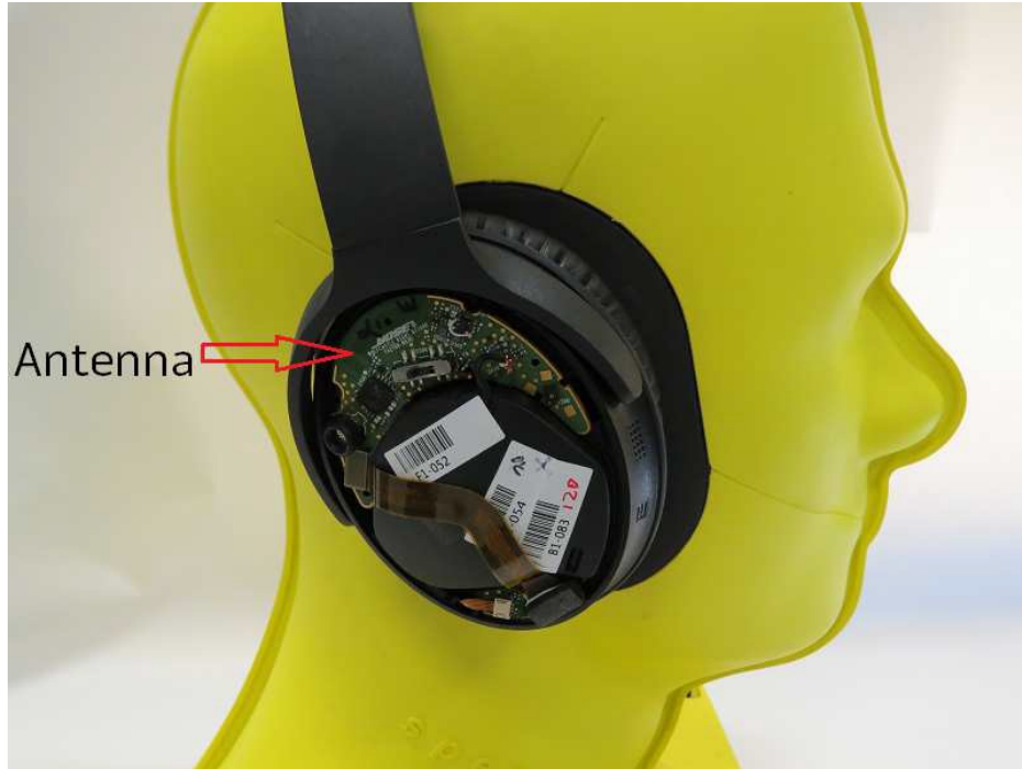
Integrated, printed inverted-F style antenna (no antenna connector present)