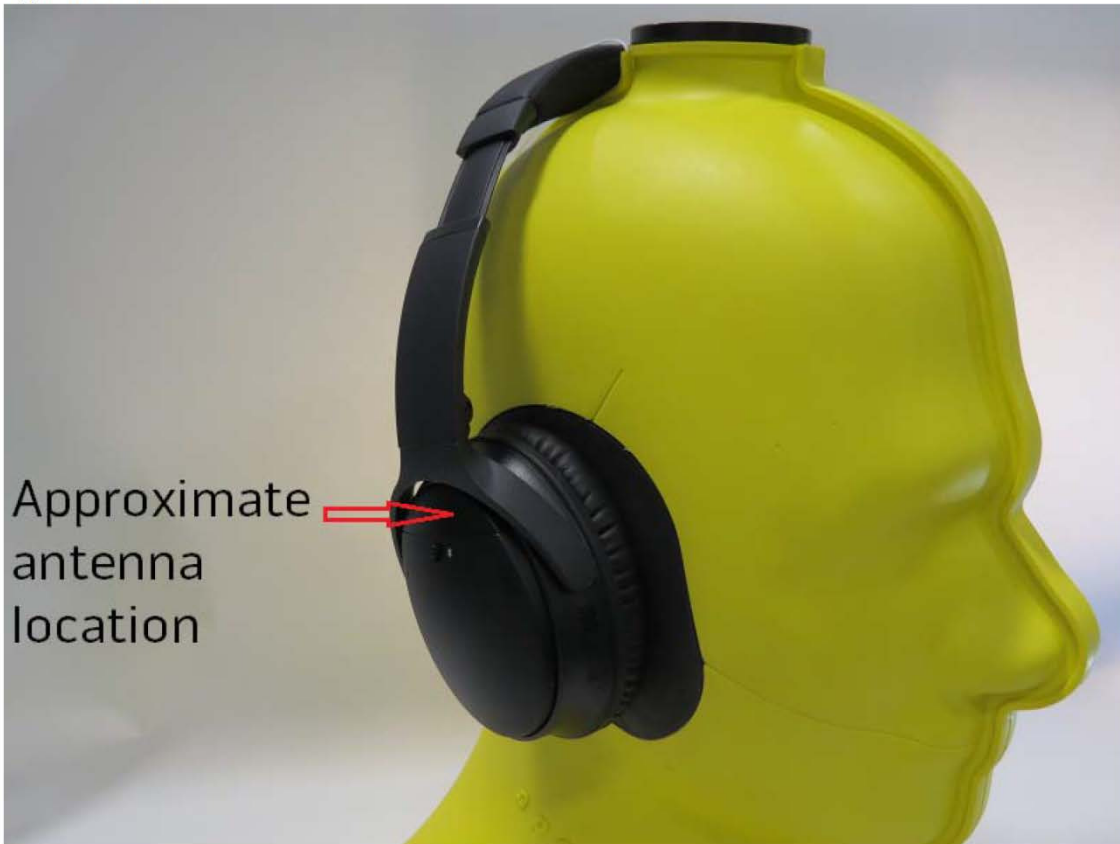
Location of Antenna