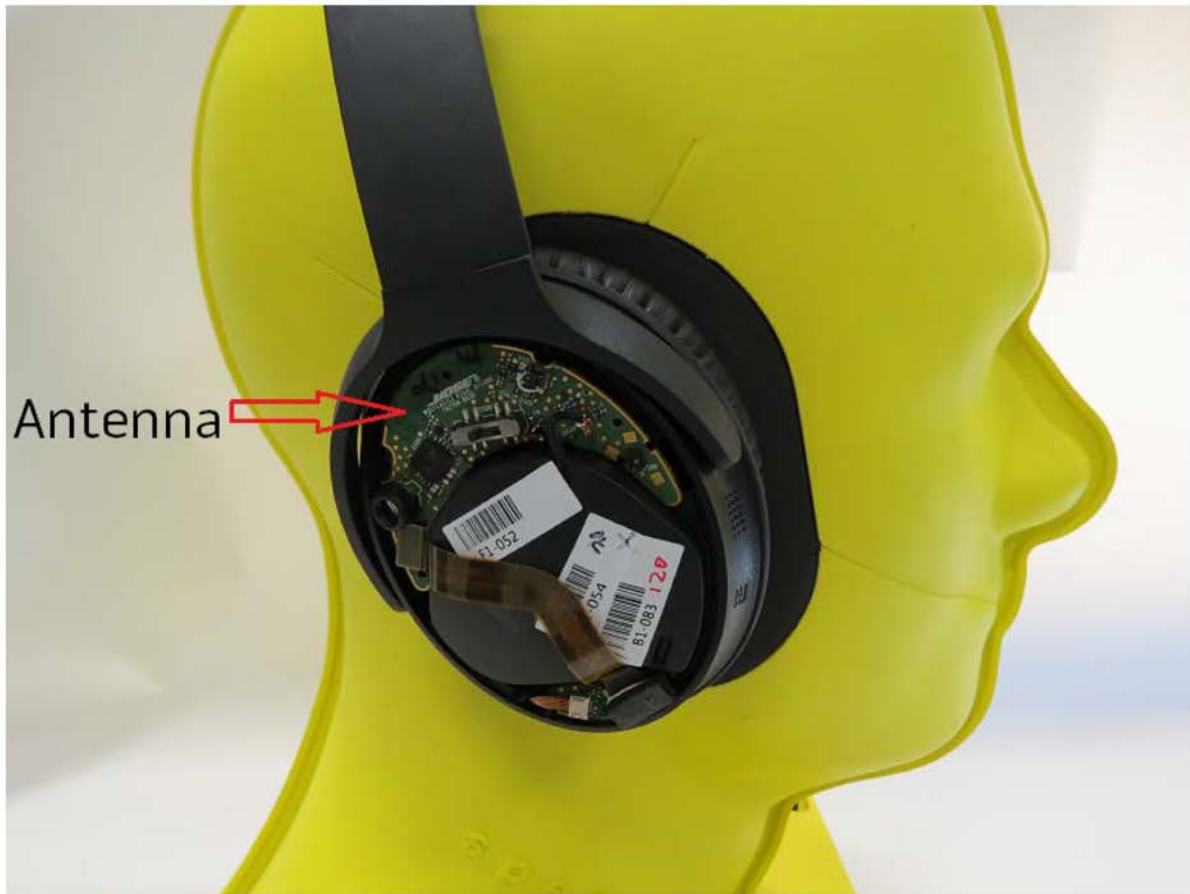
Location of Antenna with Cover Removed