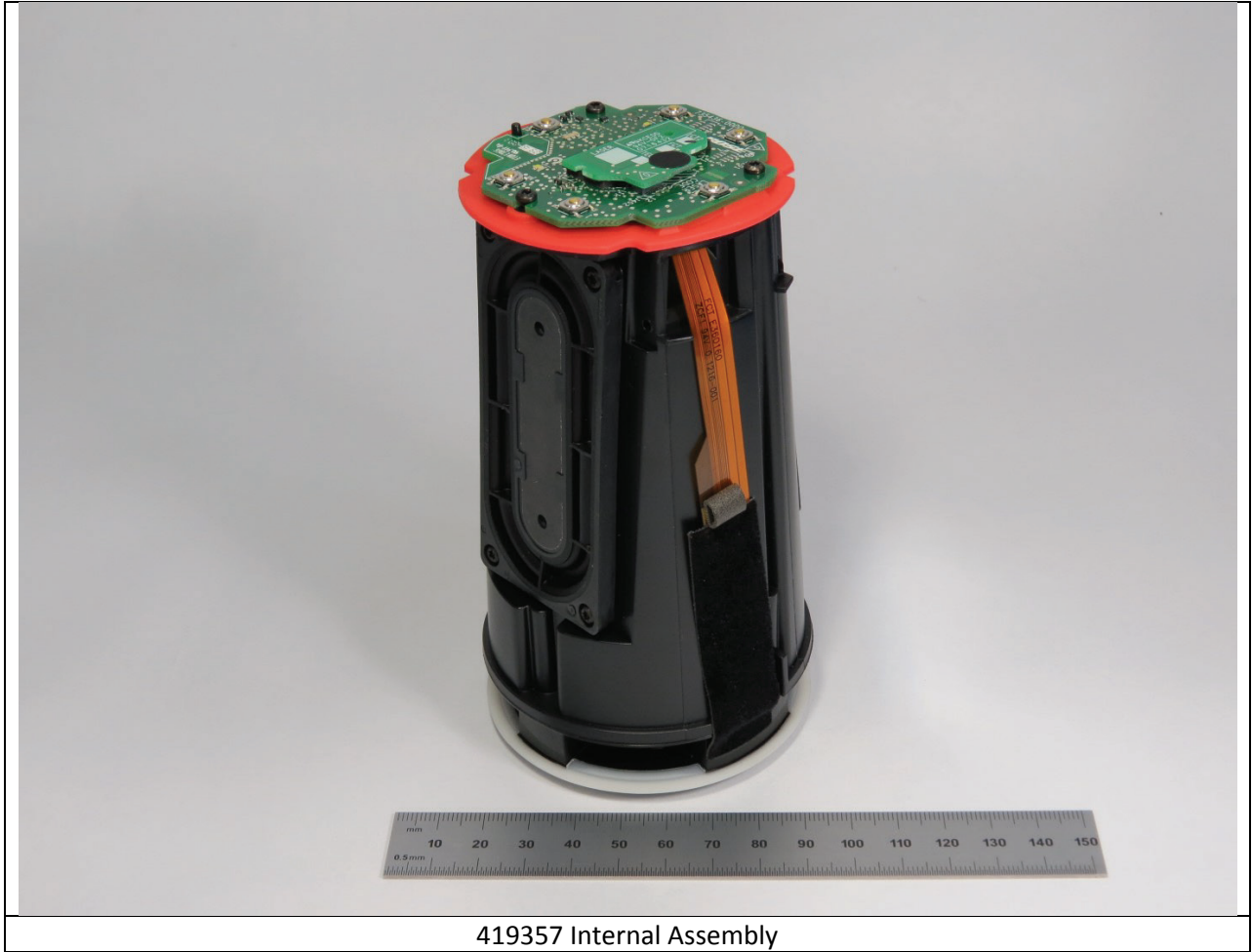
419357 Internal Assembly