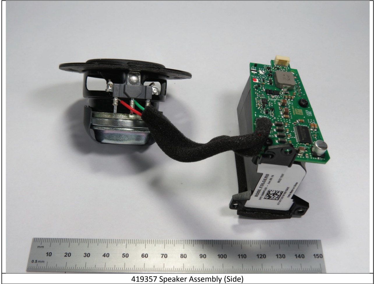
419357 Speaker Assembly (Side)