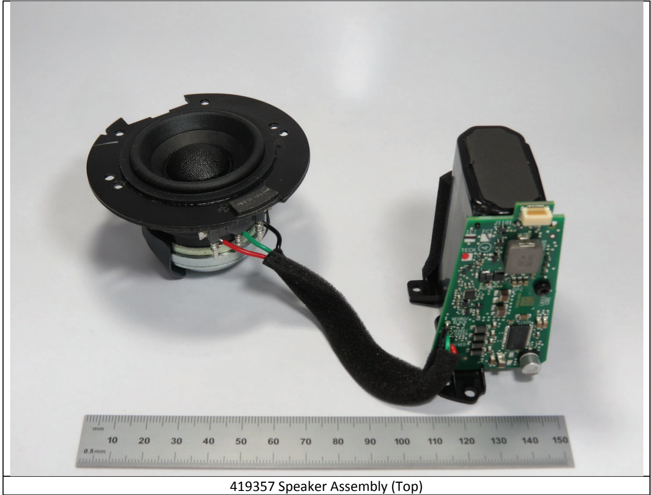
419357 Speaker Assembly (Top)