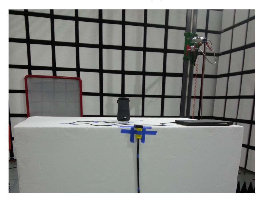
RADIATED SPURIOUS PHOTO – With Charger and Music Player