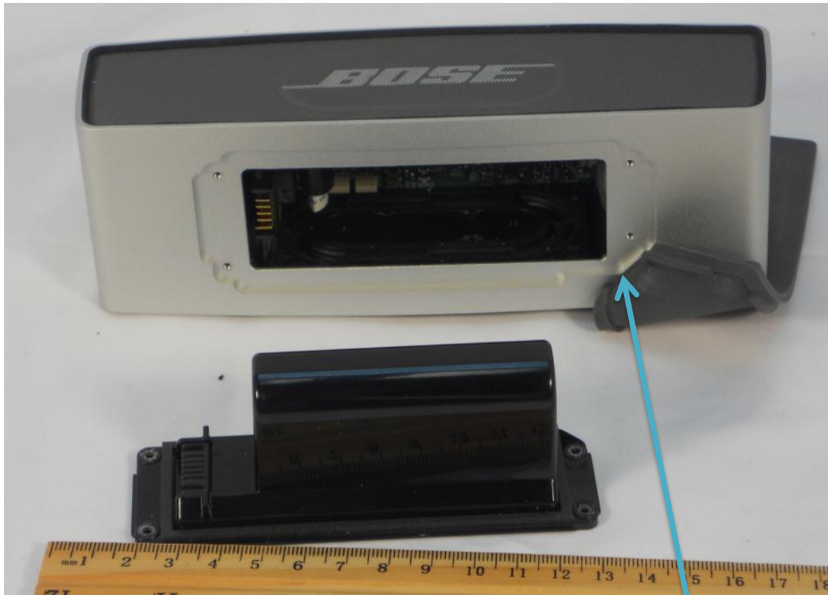
The rubber foot containing the laser etched label is attached, tethered to the frame at the corner.