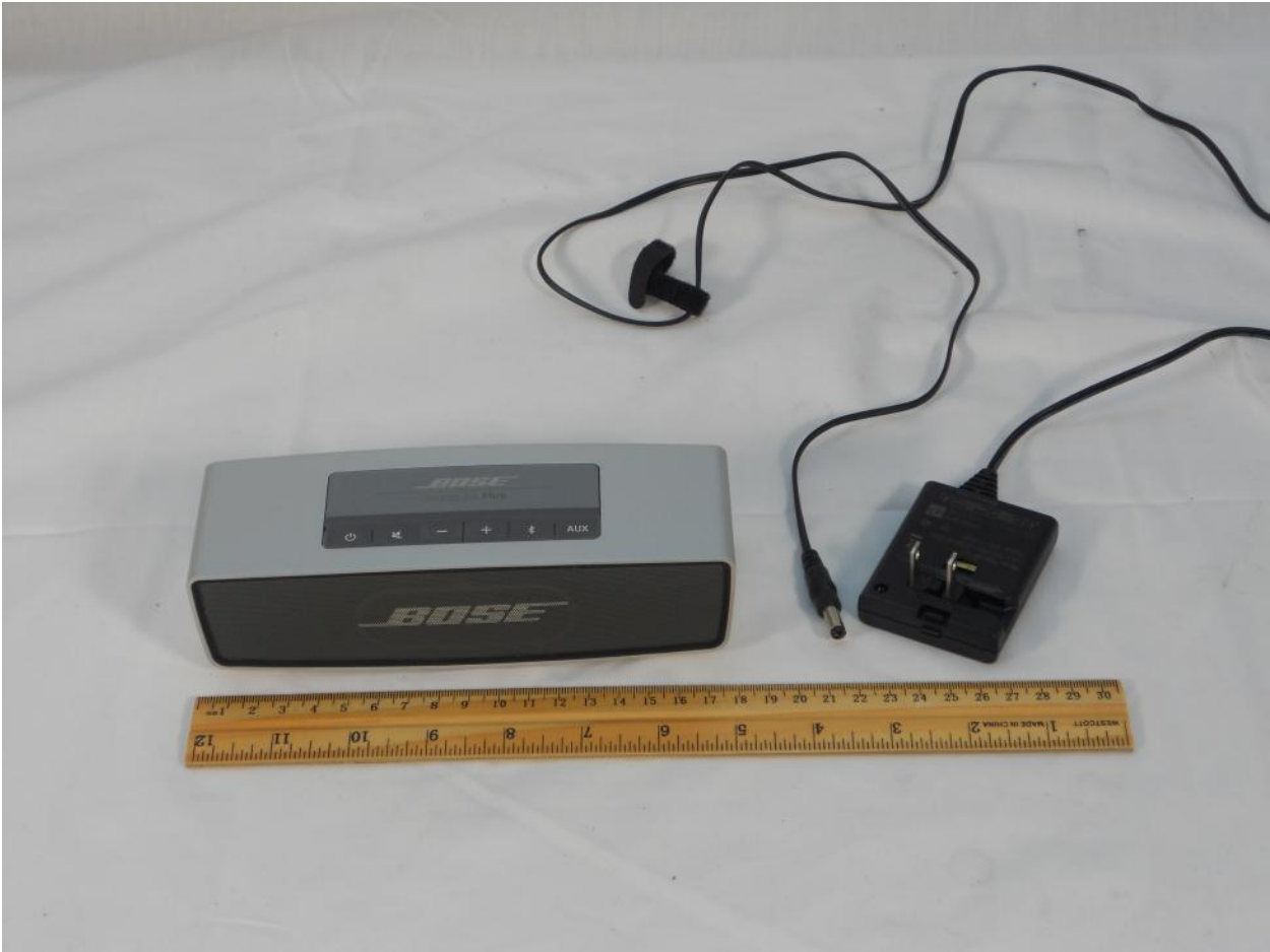
413295 External Photos