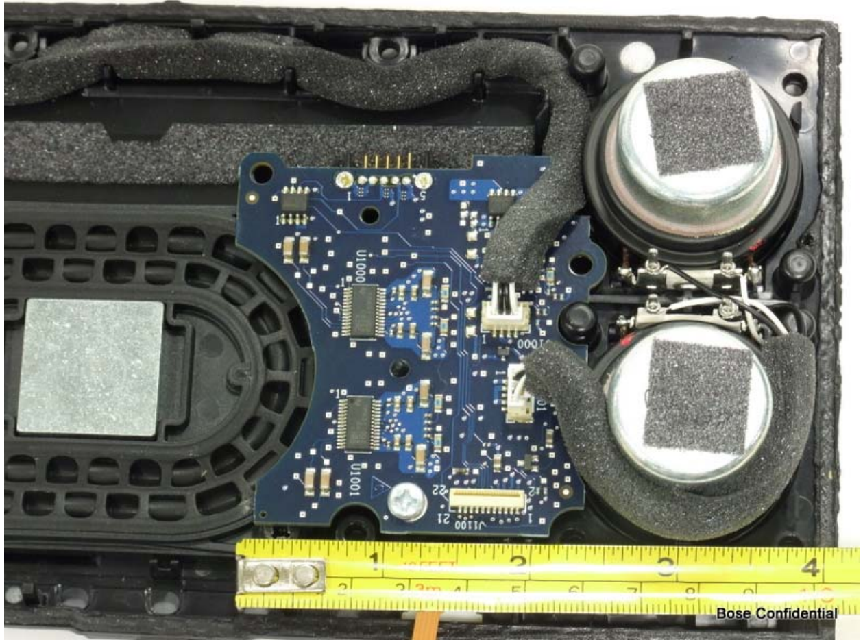
Power amplifier/power supply board