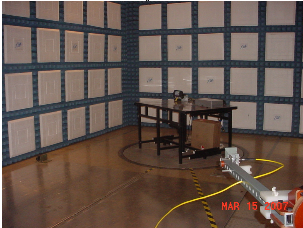
Test Set-up for Radiated Emissions – Horizontal Polarization