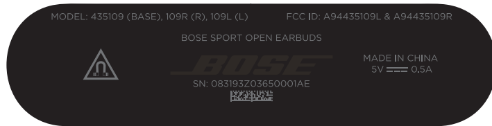
FIGURE 1.0 US ONLY VERSION