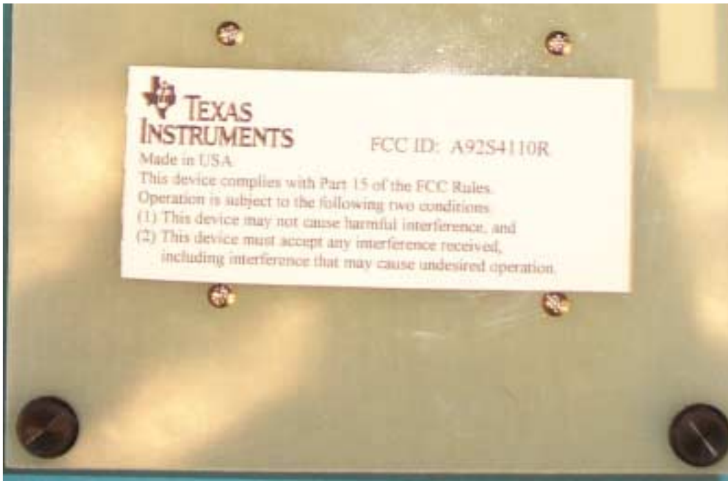
Figure 4: FCC Label on SDK S4110 MFR Evaluation Kit Reader