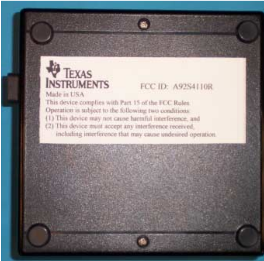
Figure 2: Boxed S4110 MFR Evaluation Kit Reader