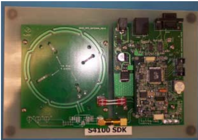
Figure 3: SDK S4110 Evaluation Kit Reader