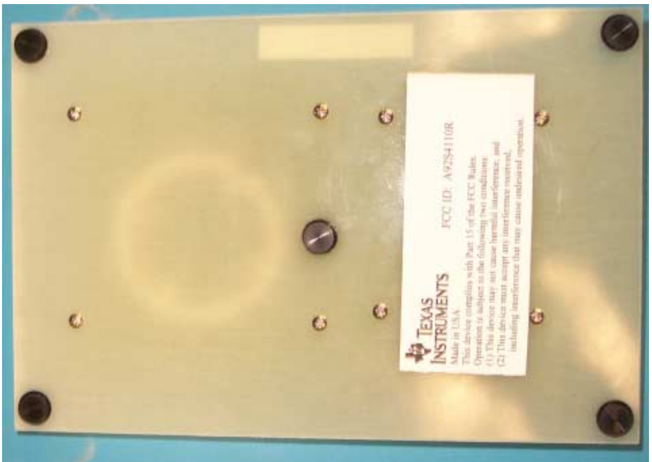
Figure 5: Label Placement on SDK S4110 MFR Evaluation Kit Reader