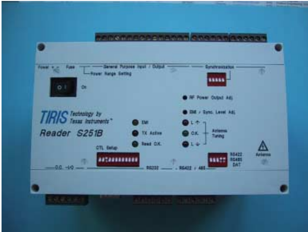
Front side shown