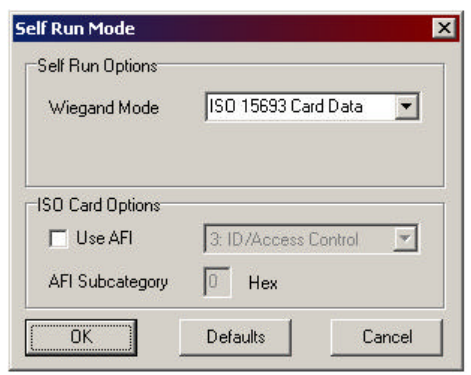
Self-Run Mode Window

Clicking the "Self Run" button brings up the Self-Run window.