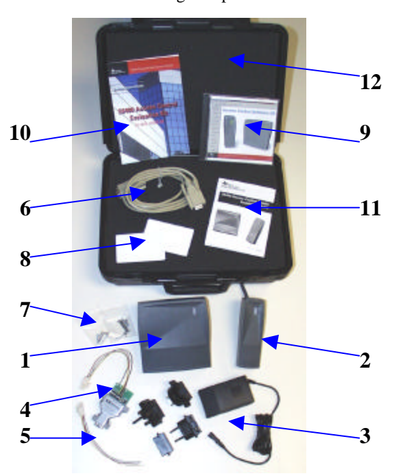
S6400 Series Evaluation Kit

The evaluation kit includes the following components: