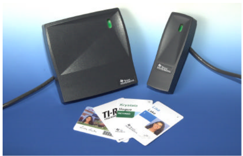
S6400 Reader Family

The Series 6400 readers are ISO/IEC 15693 compliant, and are therefore compatible with Tag-it TM HF-I badges, as well as other ISO/IEC 15693 compliant tags and cards.