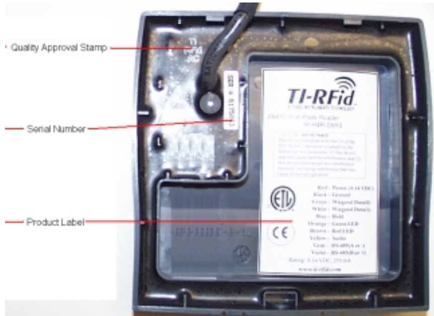
Figure 2. Backside of Wall Plate Readers with back plate removed