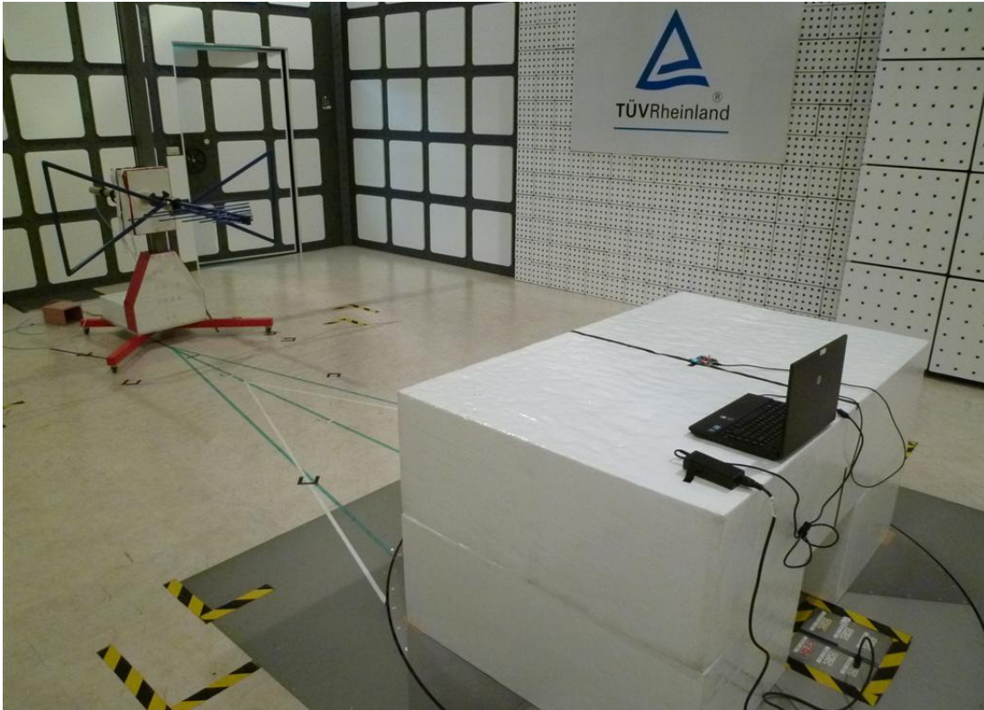
Photograph 2: Set-up for Spurious Emissions (Back View 1)