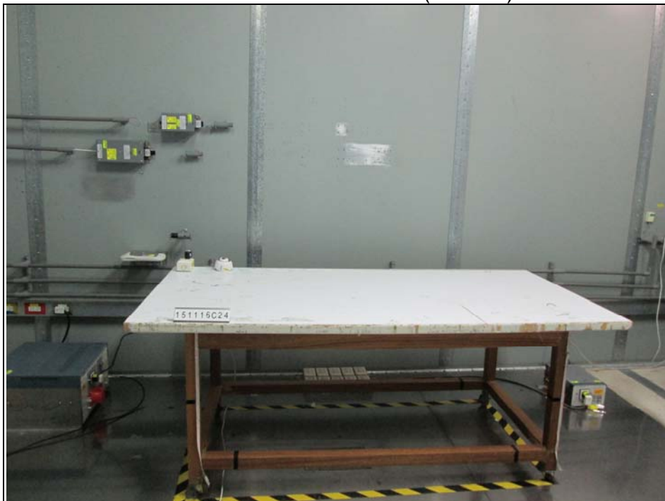
Conducted Emission Test (Mode A)