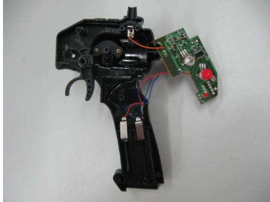
Rear View of the product (Internal)