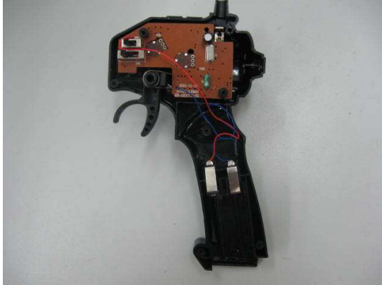
Front View of the product (Internal)