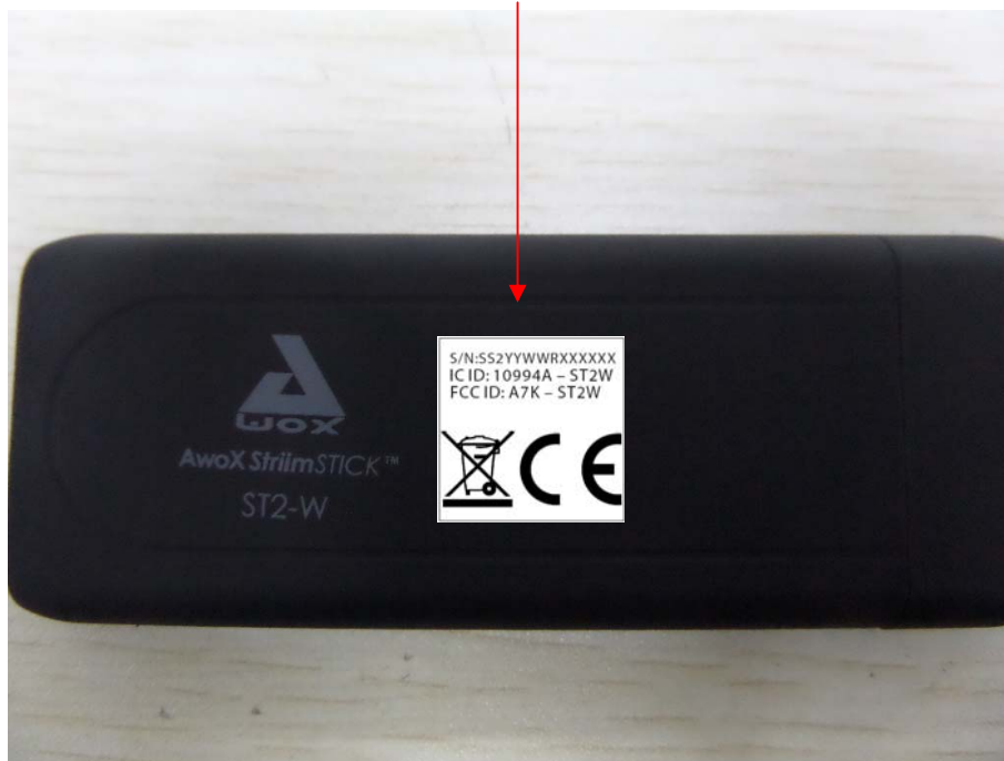
FCC ID Label Location