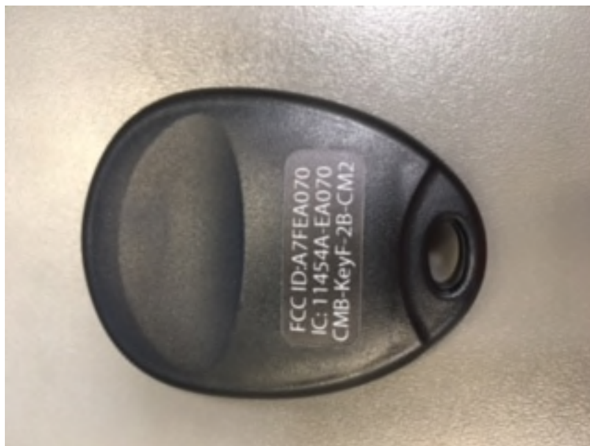
Figure 4: Back