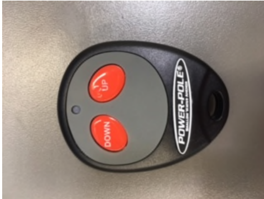
Figure 3: Front