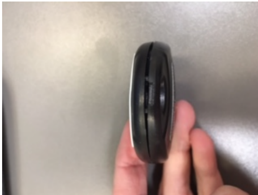
Figure 2: Bottom