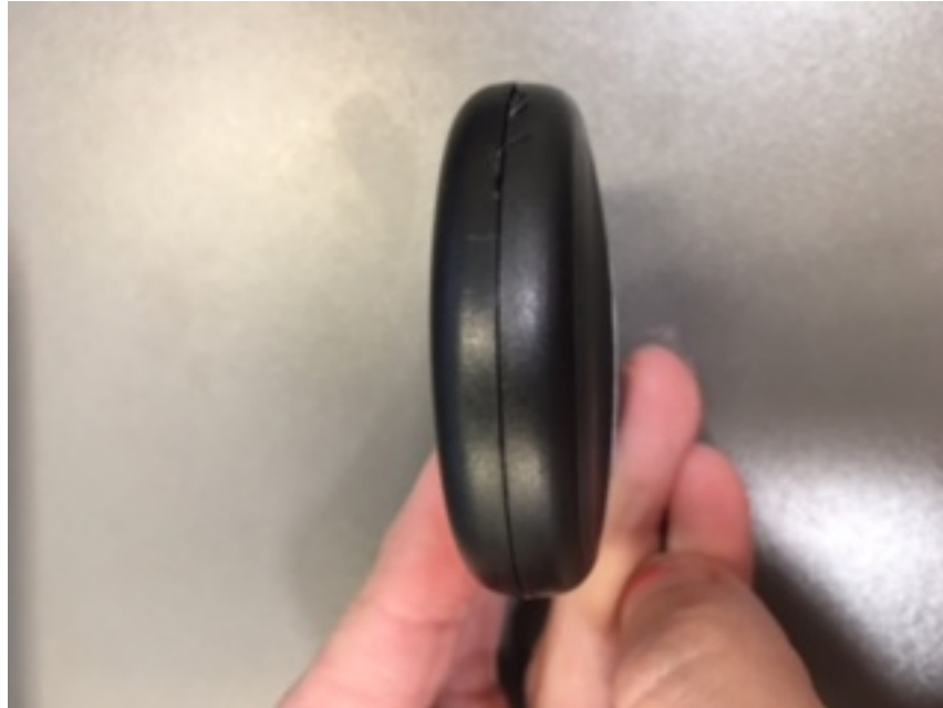
Figure 1: Top