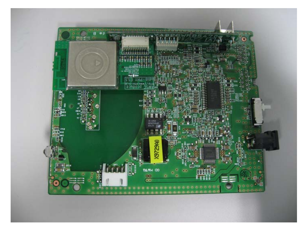
PWB Side A with Shield