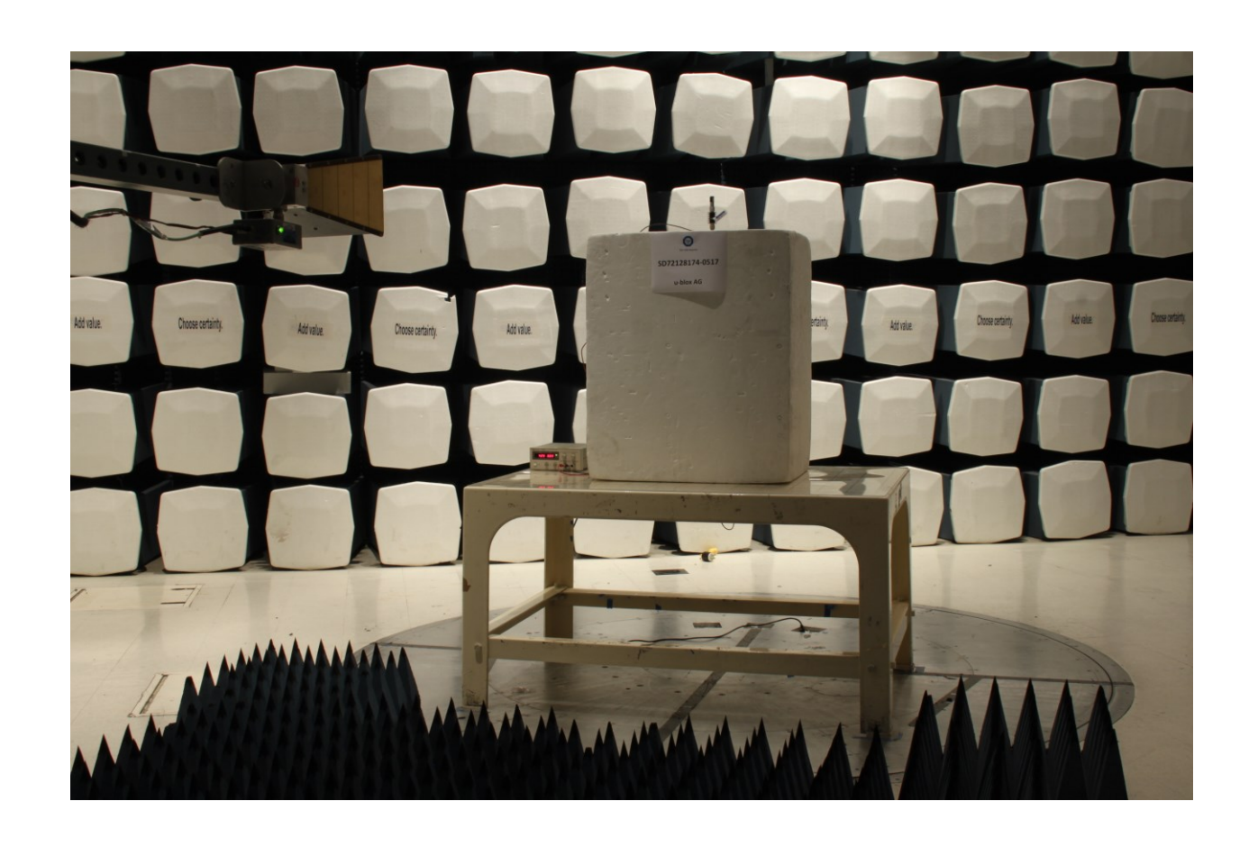
Radiated Emissions Test Setup (above 1GHz)