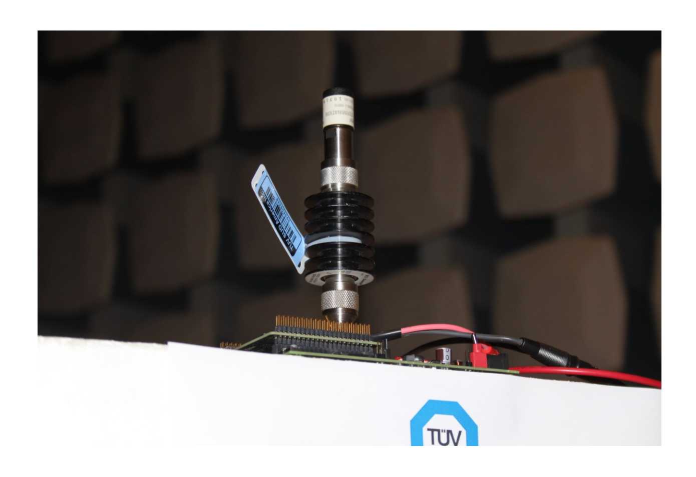
Radiated Emissions Test Setup