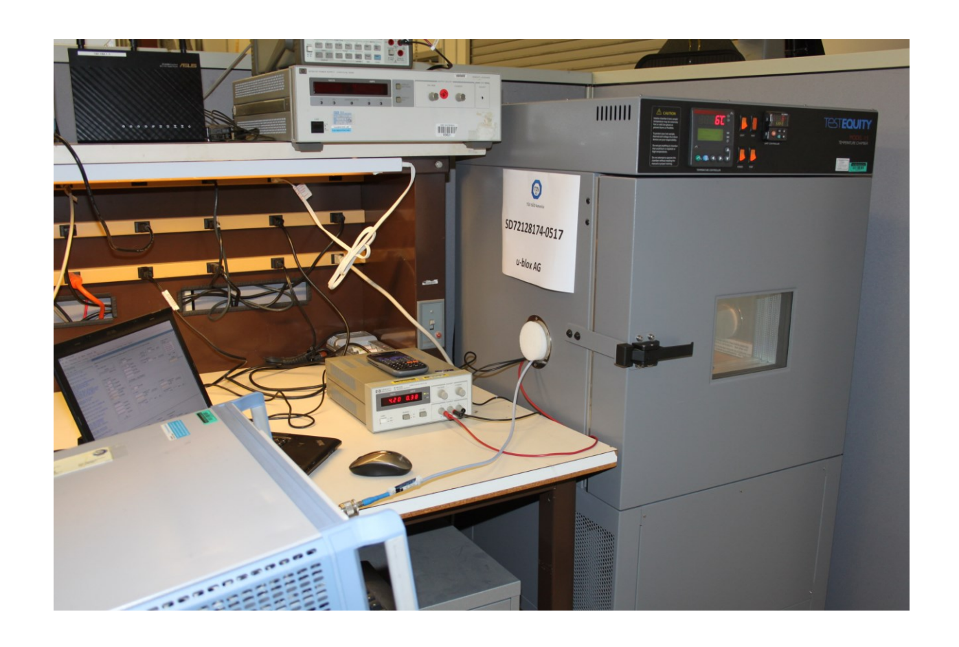
Frequency Stability Test Setup