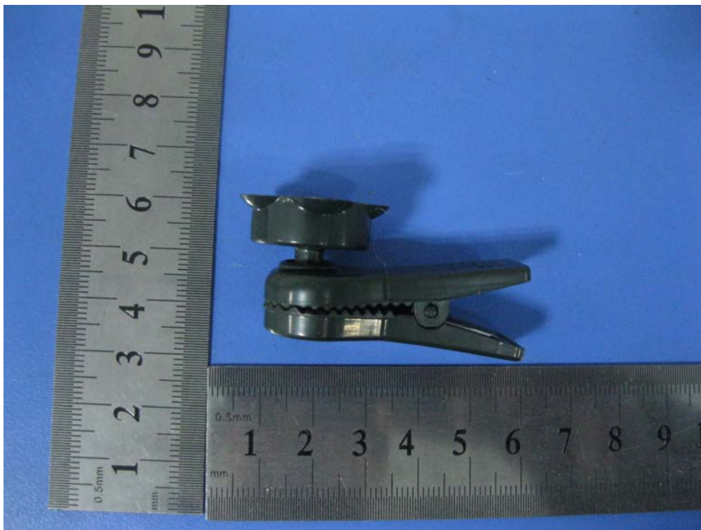
Base plate View