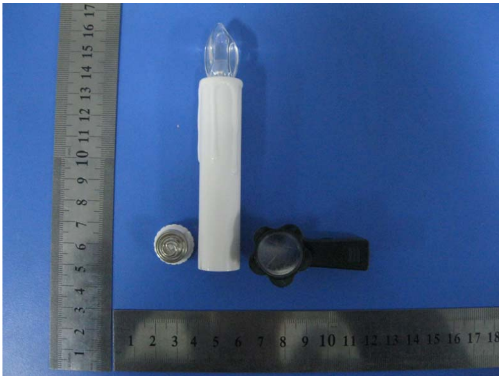
EUT – Component View Bottom cover ON